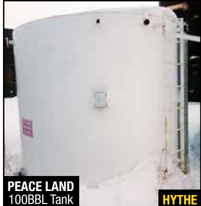
PEACE LAND 100BBL Tank HYTHE