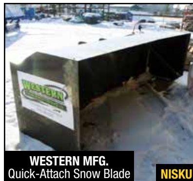
WESTERN MFG. Quick-Attach Snow Blade