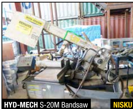
HYD-MECH S-20M Bandsaw