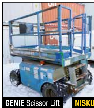
GENIE Scissor Lift