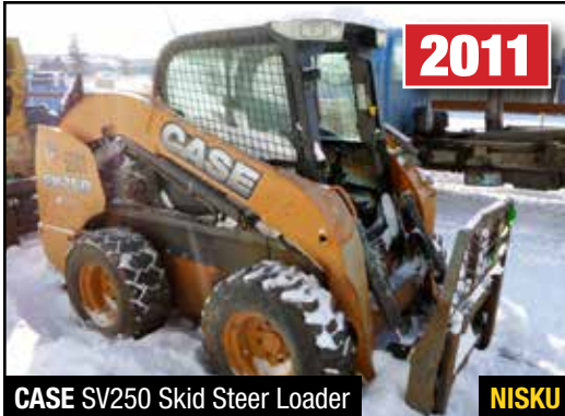
CASE SV250 Skid Steer Loader