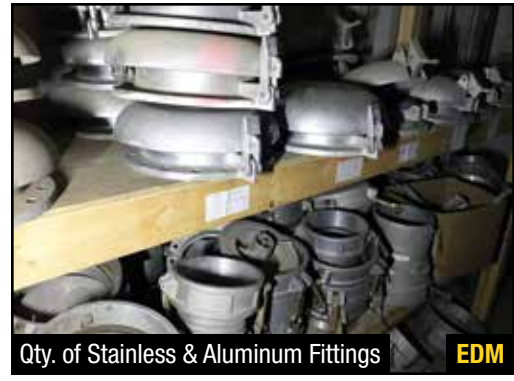
Qty. of Stainless & Aluminum Fittings EDM