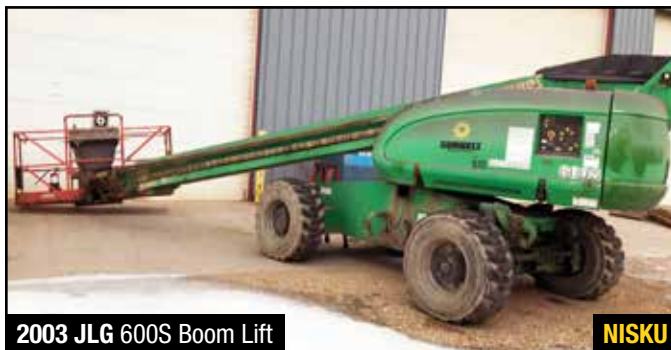
2003 JLG 600S Boom Lift

★ A 18% BUYERS PREMIUM APPLIES TO ALL SALES ★