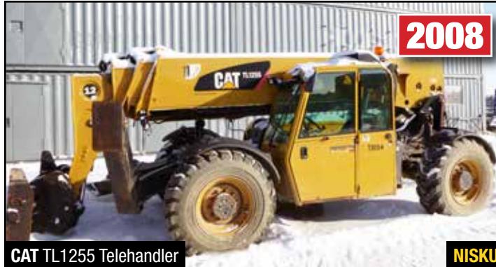
CAT TL1255 Telehandler