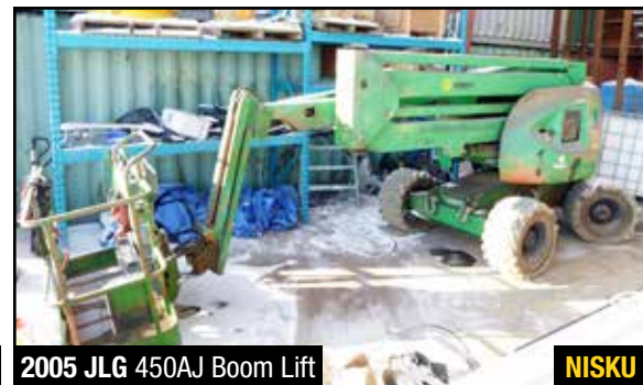
2005 JLG 450AJ Boom Lift