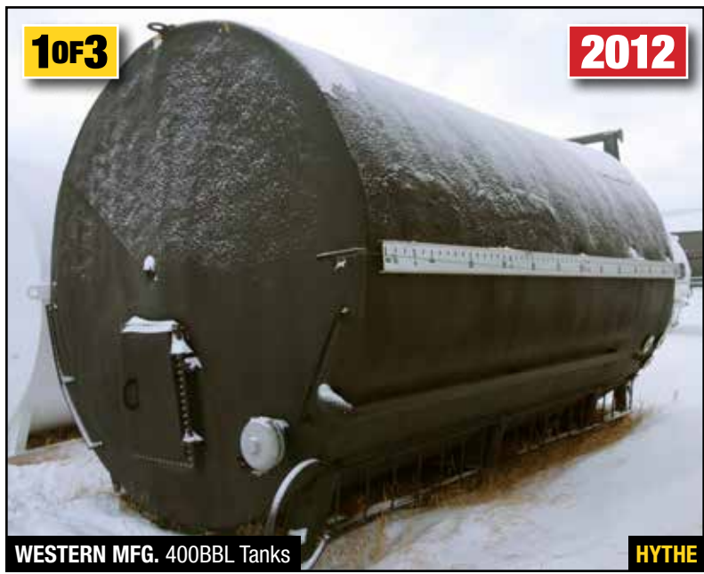
WESTERN MFG. 400BBL Tanks HYTHE