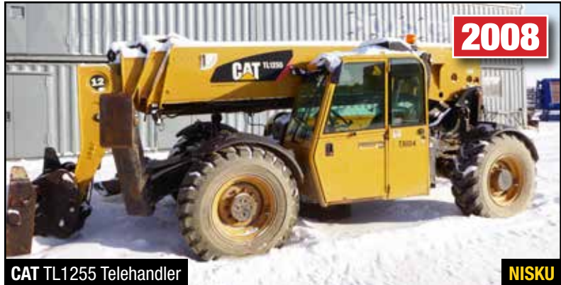
CAT TL1255 Telehandler