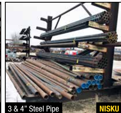
3 & 4" Steel Pipe