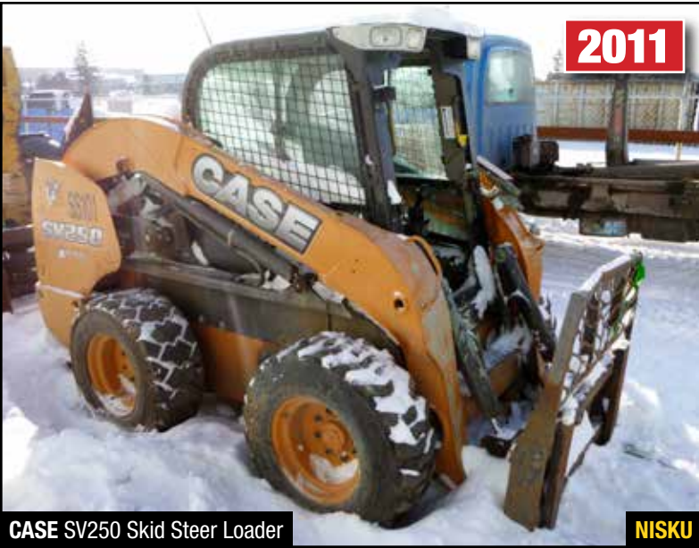
CASE SV250 Skid Steer Loader