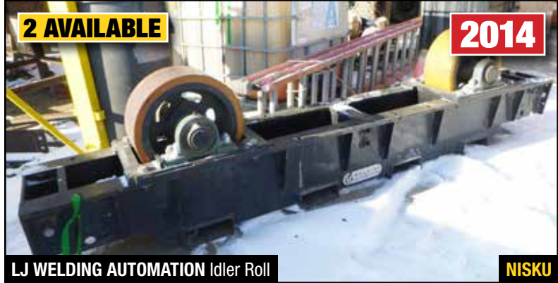
LJ WELDING AUTOMATION Idler Roll