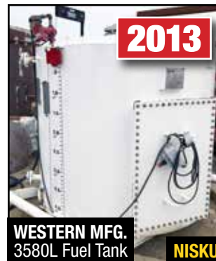
2013 WESTERN MFG. 3580L Fuel Tank