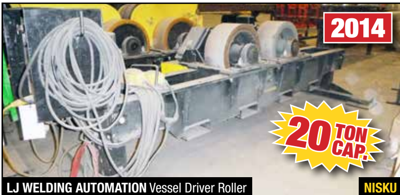
LJ WELDING AUTOMATION Vessel Driver Roller