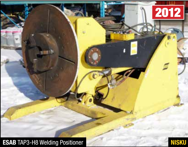
ESAB TAP3-H8 Welding Positioner