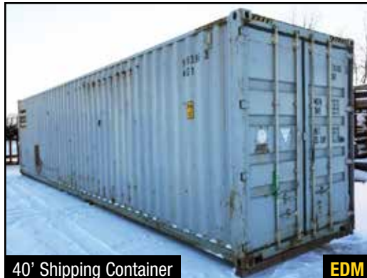
40' Shipping Container EDM