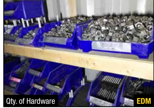
Qty. of Hardware EDM