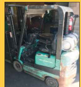
Mitsubishi Propane Forklift