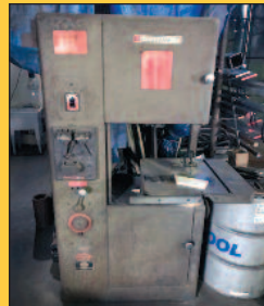
Powermatic Vertical Band Saw