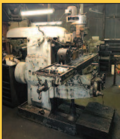
Cincinnati Combination Milling Machine