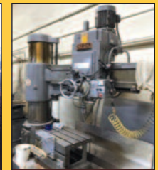
Ikeda RM1875 Radial Arm Drill