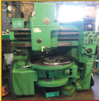
Fellows No. 36A Gear Shaper

MAZAK, HURCO & HAAS VMC's, BARBER-COLMAN, GOULD & EBERHARDT HOBBIING MACHINES, FELLOWS GEAR SHAPERS, TOOL & CUTTER GRINDERS, SAWS, MILLS, LATHES & MORE