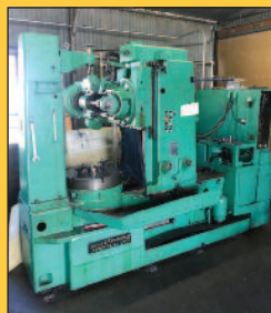
Gould & Eberhardt 24H Gear Hobber