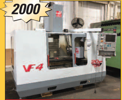
Haas VF4 CNC VMC