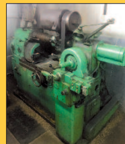
Bryant 15x16 ID Grinder