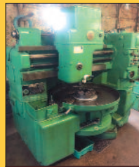
Fellows No. 36A Gear Shaper