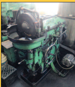
Arter Rotary Surface Grinder