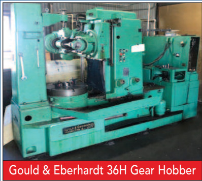
Gould & Eberhardt 36H Gear Hobber

VMC's, HOBBING MACHINES, GEAR SHAPERS, TOOL & CUTTER GRINDERS, SAWS, MILLS, LATHES & MORE