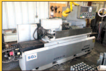
Okamoto OGM 12 x 20 CNC OD Grinder