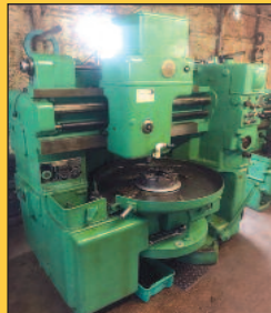
Fellows No. 36A Gear Shaper