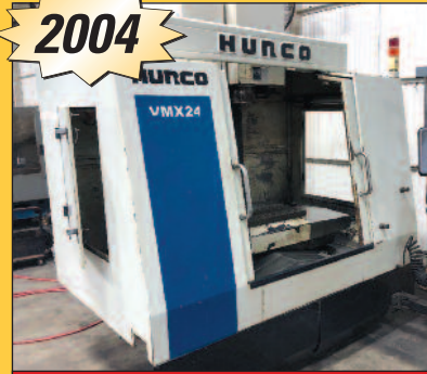
Hurco VMX24 CNC VMC