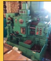
Fellows No. 4A Gear Shaper