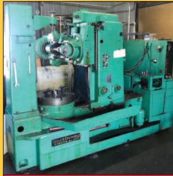
Gould & Eberhardt 36H Gear Hobber