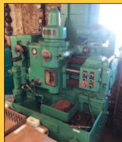
Fellows No. 4A Gear Shaper