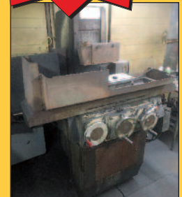
Brown & Sharpe 6x18 Surface Grinder