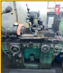
Brown & Sharpe 10x24 O.D. Grinder