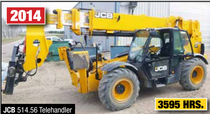
2014 JCB 514.56 Telehandler