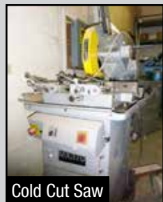
Cold Cut Saw