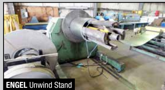
ENGEL Unwind Stand