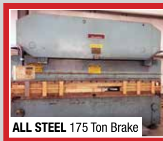
ALL STEEL 175 Ton Brake