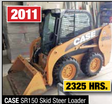
2011 CASE SR150 Skid Steer Loader