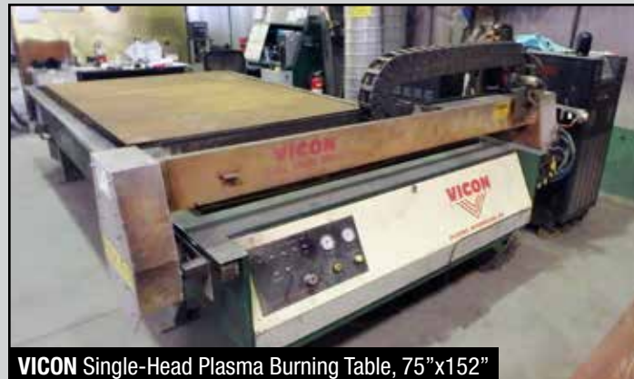
VICON Single-Head Plasma Burning Table, 75"x152"