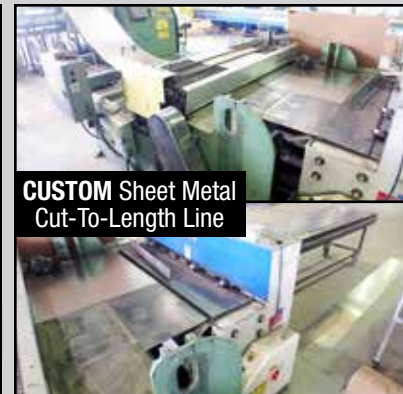
CUSTOM Sheet Metal Cut-To-Length Line