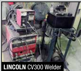
LINCOLN CV300 Welder