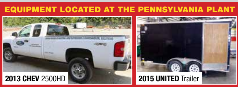
2013 CHEV 2500HD