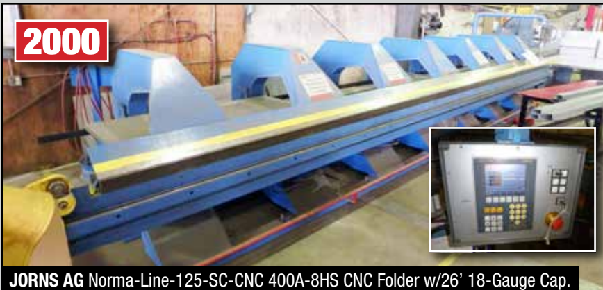
2000 JORNS AG Norma-Line-125-SC-CNC 400A-8HS CNC Folder w/26' 18-Gauge Cap.