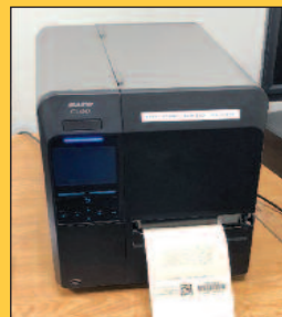
Sato Label Printer