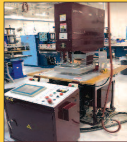
JTE RF Welder