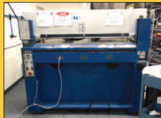
Clicker S350 Beam Press