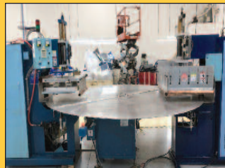
Hall Dielectric RF Welders