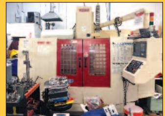
Baron-Max VMC-40 VMC