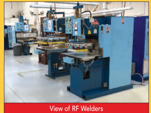
View of RF Welders