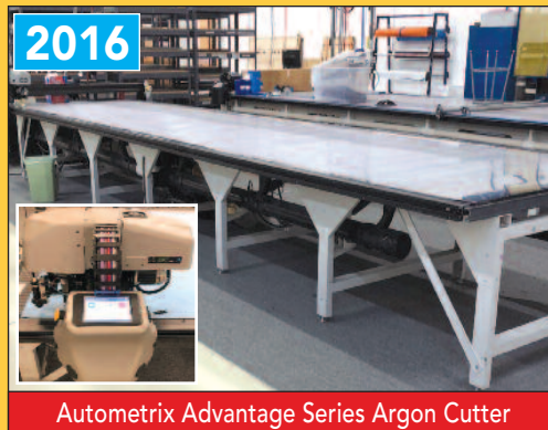
Autometrix Advantage Series Argon Cutter