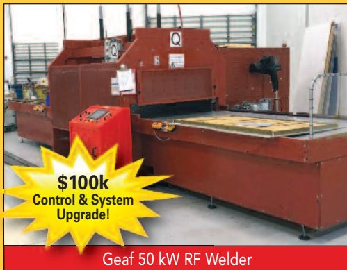
Geaf 50 kW RF Welder