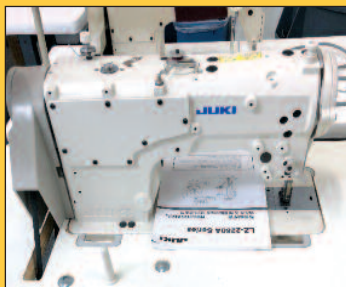
Juki LZ-2280A Sewing Machine