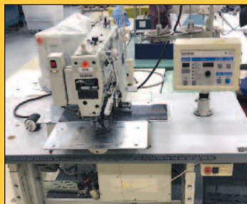
Brother Sewing Machine