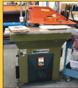
Atom SE 25L Press