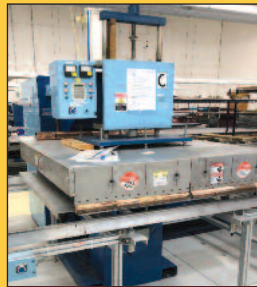
20 kW RF Welder