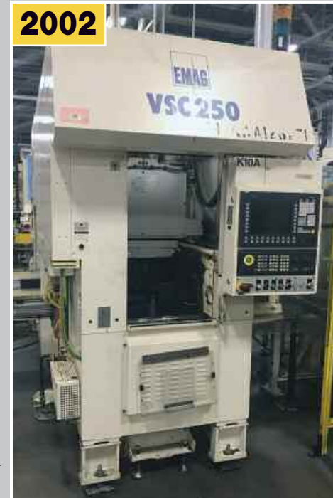
EMAG VSC 250 CNC Vertical Turning Center