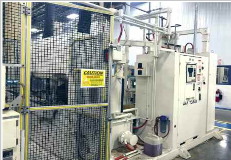
TOCCO Induction Hardener