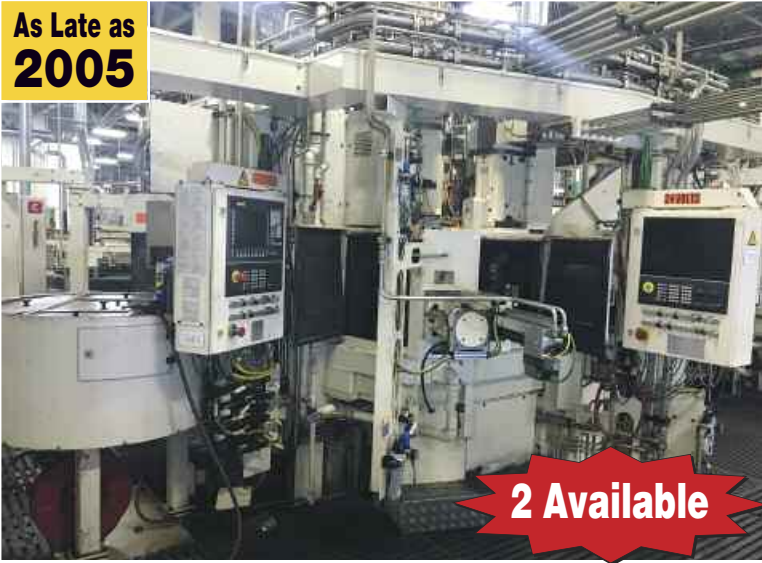
WITZIG & FRANK TURMAT 48/140-R2 Rotary Transfer & Multi-Spindle Machine