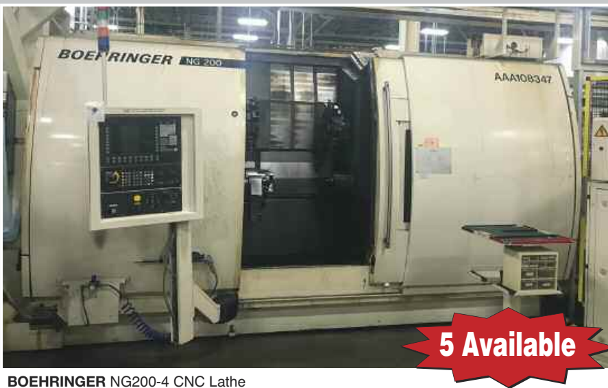
BOEHRINGER NG200-4 CNC Lathe