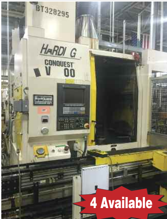
HARDINGE VTL-200 CNC Vertical Lathe