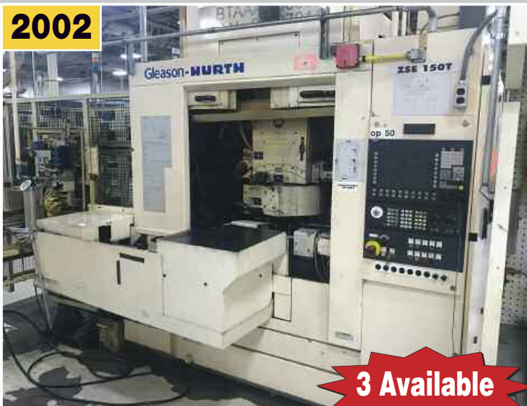
GLEASON-HURTH ZSE150T CNC Gear Shaver