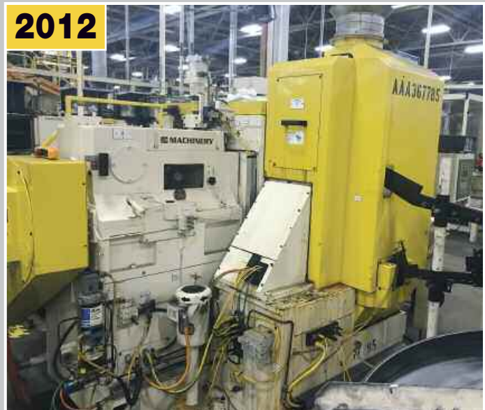
C&B CB-R242-30 Horizontal Double Disc Grinder