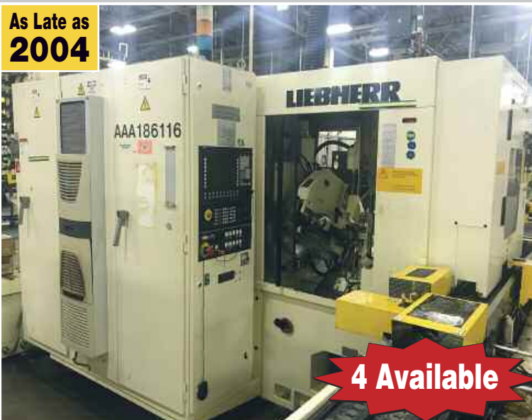
LIEBHERR LC120 CNC Gear Hobber