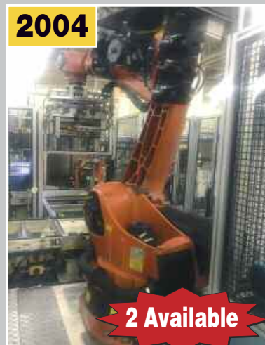
KUKA KR150 Robots