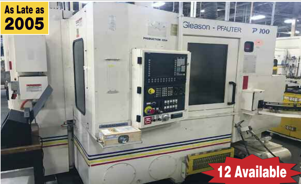
GLEASON-PFAUTER P100 CNC Gear Hobber