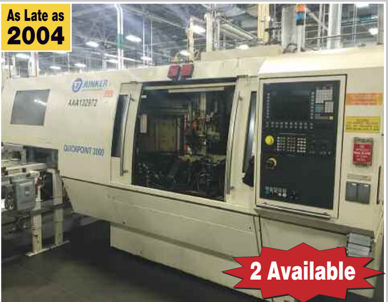
JUNKER JUMAT-QUICKPOINT 3000/50 CNC Cylindrical Grinder