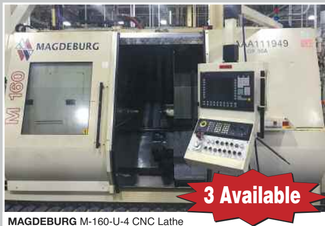
MAGDEBURG M-160-U-4 CNC Lathe