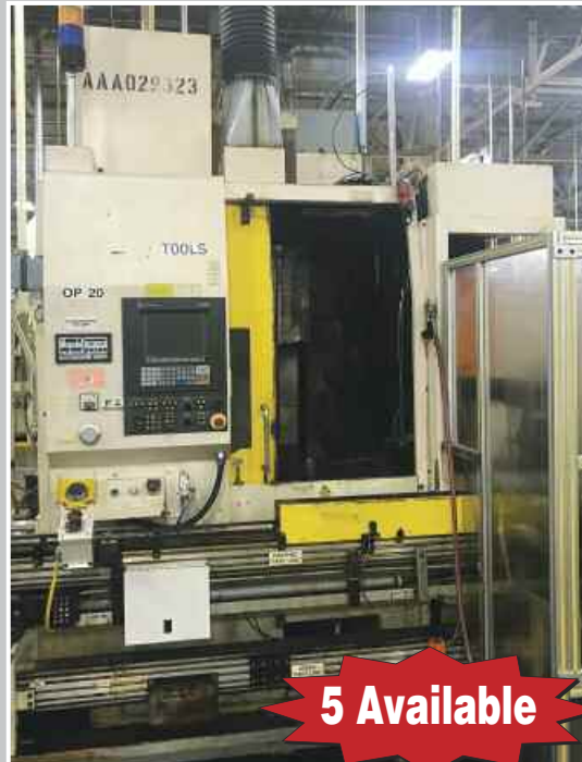
HARDINGE VTL-100 CNC Vertical Lathe