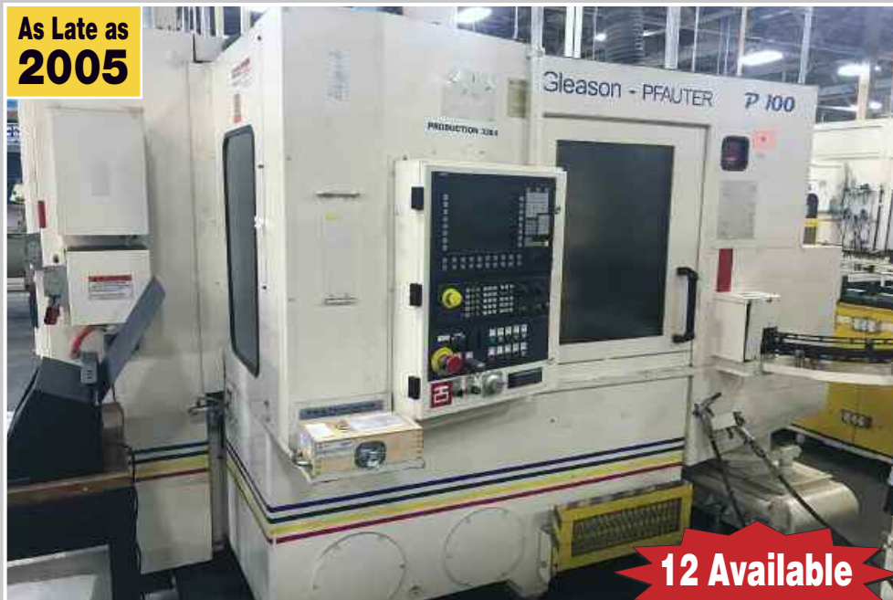
GLEASON-PFAUTER P100 CNC Gear Hobber