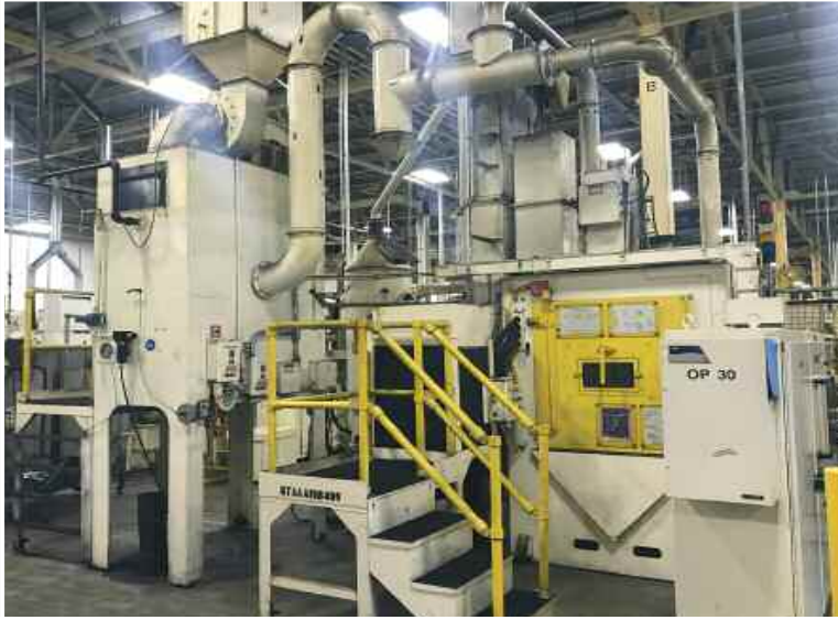
ENGINEERED ABRASIVES Type 48 Index Shot Blast System