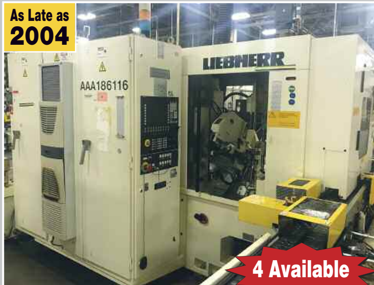
LIEBHERR LC120 CNC Gear Hobber