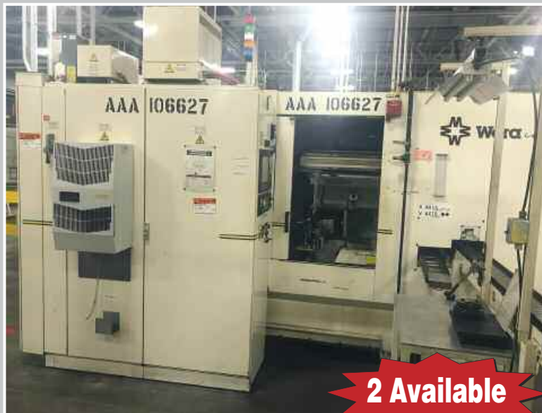
WERA ID Pointer/Profilator