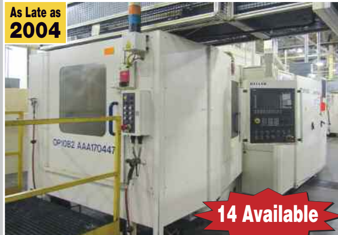
HELLER MC-16 CNC Horizontal Machining Center