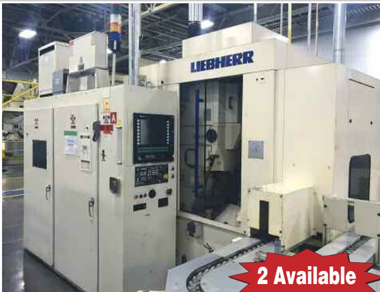
LIEBHERR Gear Shaper