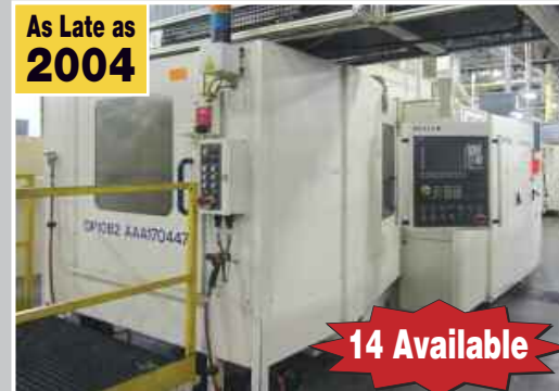
MAGDEBURG M-160-U-4 CNC Lathe