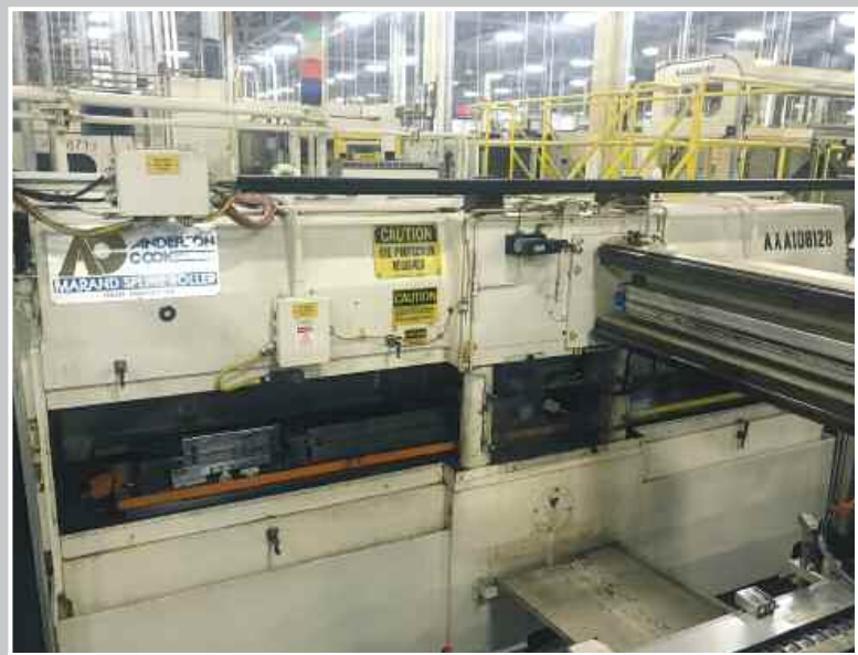
ANDERSON COOK-MARAND 350-S Spline Roller