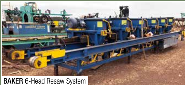
BAKER 6-Head Resaw System