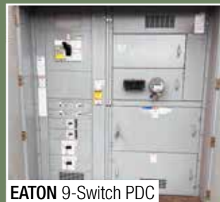
EATON 9-Switch PDC