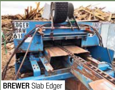
BREWER Slab Edger