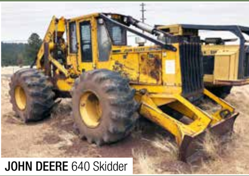
JOHN DEERE 640 Skidder