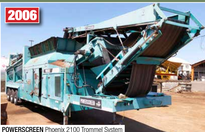
POWERSCREEN Phoenix 2100 Trommel System