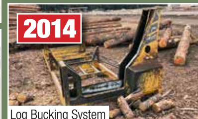
Log Bucking System