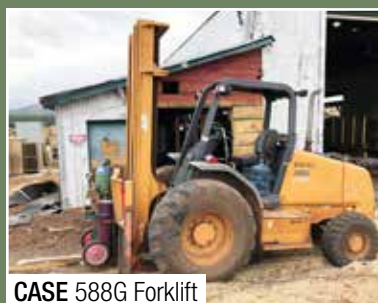
CASE 588G Forklift