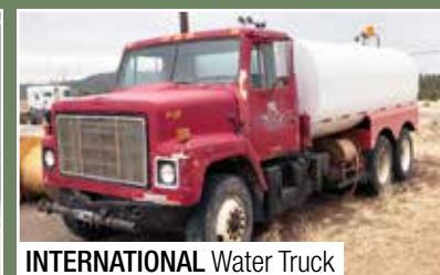
INTERNATIONAL Water Truck