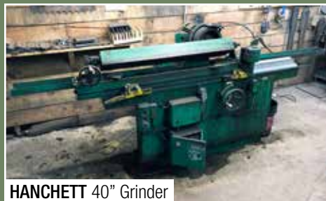
HANCHETT 40" Grinder