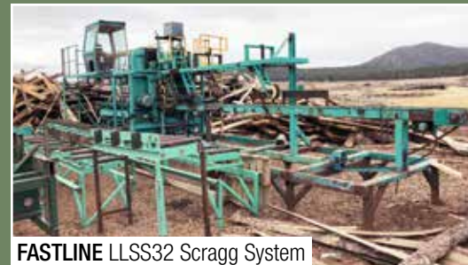
FASTLINE LLSS32 Scragg System