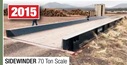
SIDEWINDER 70 Ton Scale