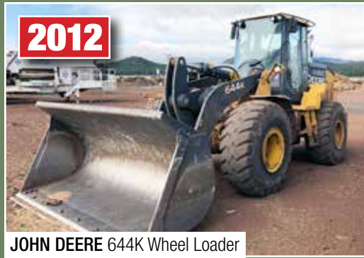
JOHN DEERE 644K Wheel Loader