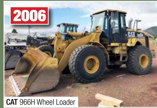
CAT 966H Wheel Loader