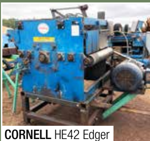
CORNELL HE42 Edger