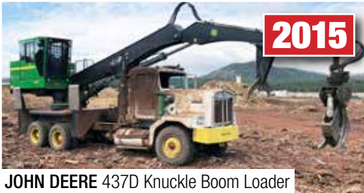
JOHN DEERE 437D Knuckle Boom Loader