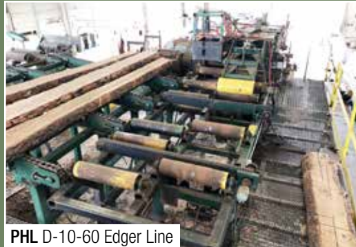
PHL D-10-60 Edger Line