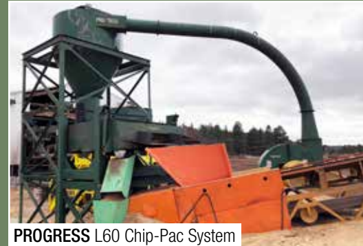
PROGRESS L60 Chip-Pac System