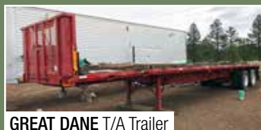
GREAT DANE T/A Trailer