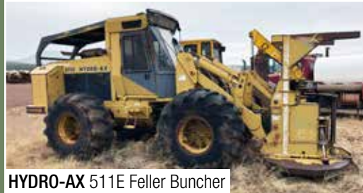
HYDRO-AX 511E Feller Buncher