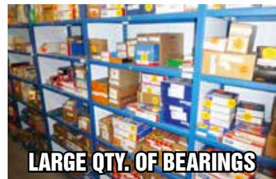
LARGE QTY. OF BEARINGS