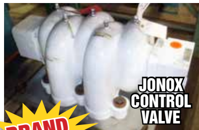
JONOX CONTROL VALVE

VOITH SULZER KAMYR ANDRITZ GOULDS WORTHINGTON SIEMENS PROCHEM