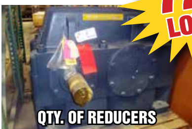
QTY. OF REDUCERS