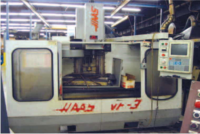
HAAS VF-3 CNC Vertical Machining Center