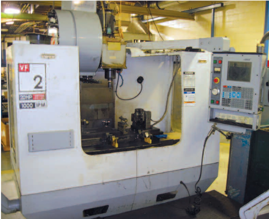
HAAS VF-2D CNC Vertical Machining Center

CNC Lathes, CNC Vertical and Horizontal Machining Centers, Tool Room Equipment, Inspection Equipment & Much More