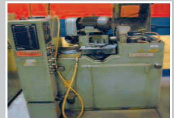
MIKRON A62/0 Gear Hobber