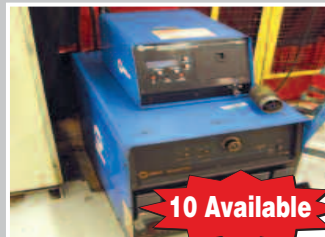
MILLER 652 Welder