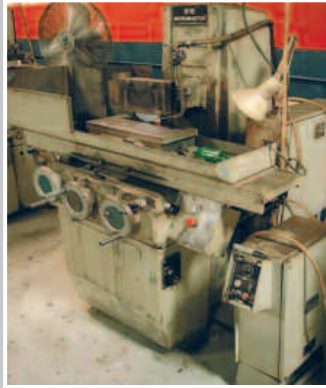
B&S Micromaster 818 Grinder