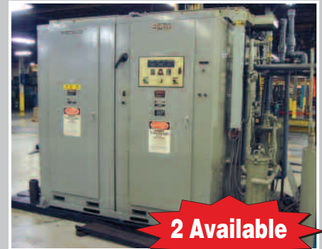
AJAX Tocco Pacer