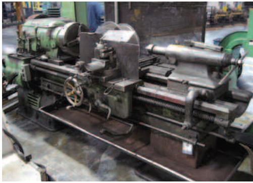
HENDY Engine Lathe