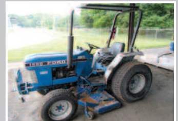
FORD 1520 Tractor