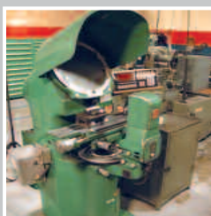
J&L Optical Comparator