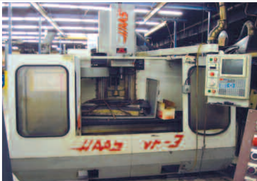
HAAS VF-3 CNC Vertical Machining Center