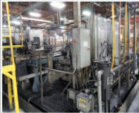
TAYLOR WINFIELD 4 Station Heat Treat