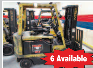
HYSTER E60XM Elect. Forklift