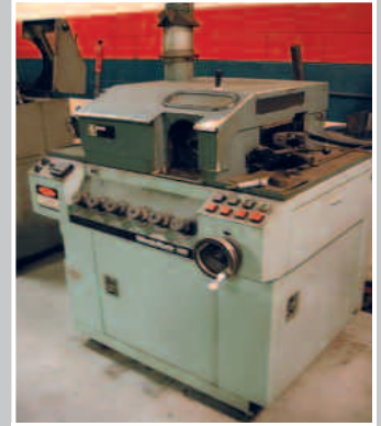
G&L HR Auto. Drill Point Grinder