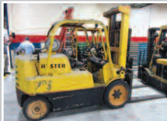
HYSTER S125A Forklift