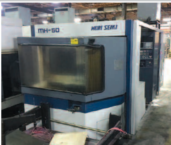
MORI SEIKI MH-50 CNC HMC