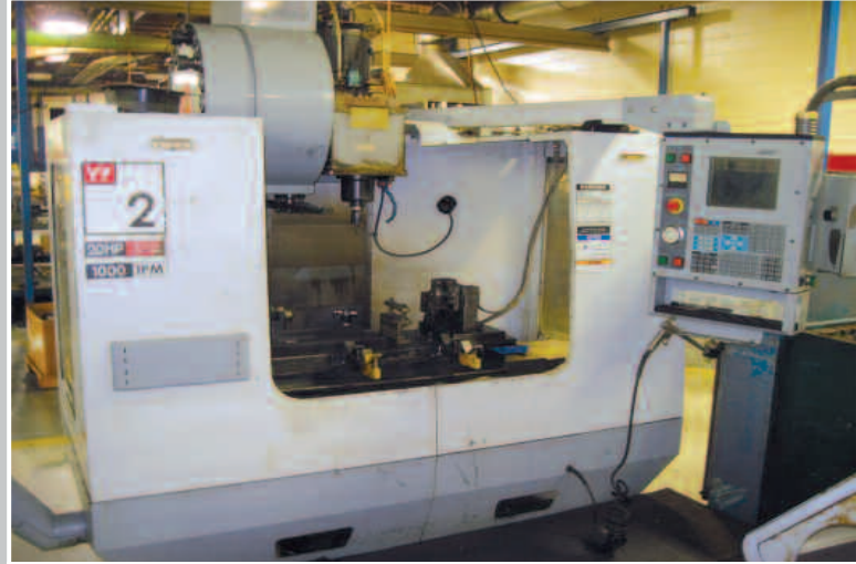
HAAS VF-2D CNC Vertical Machining Center