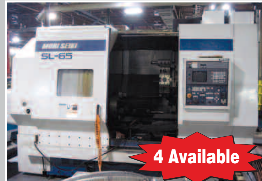
MORI SEIKI SL-65 CNC Turning Center