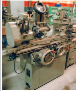
B&S No.13 Surface Grinder