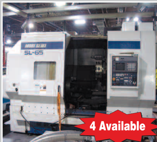
MORI SEIKI SL-65 CNC Turning Center