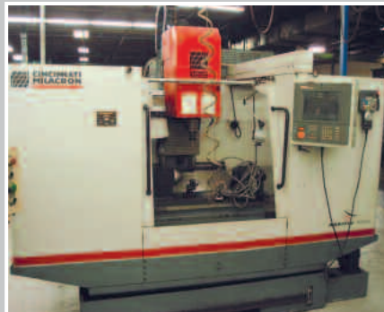
CINCINNATI Arrow 1000 CNC VMC