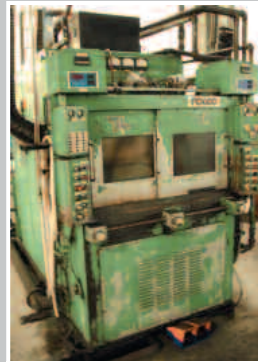
AJAX Induction Furnace