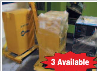
MILLER Access 675 Welders