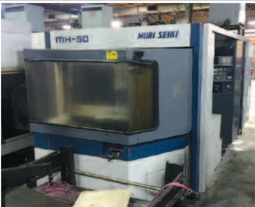
MORI SEIKI MH-50 CNC HMC