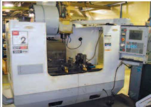
HAAS VF-2D CNC Vertical Machining Center