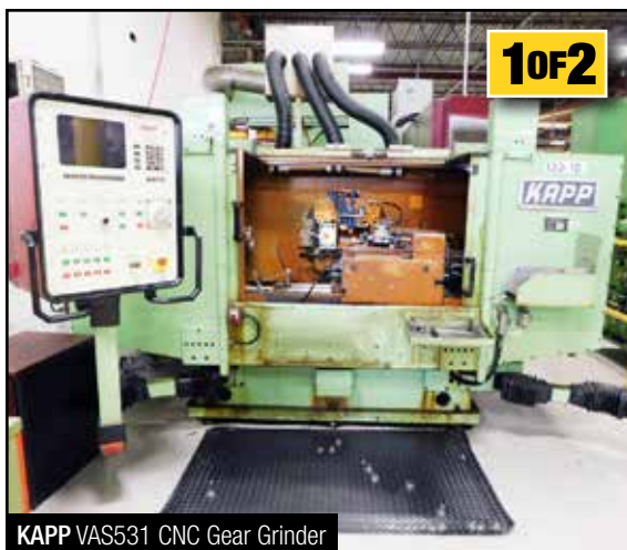
KAPP VAS531 CNC Gear Grinder