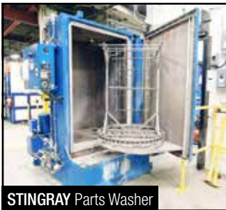
STINGRAY Parts Washer