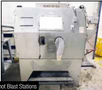
BLAST-IT-ALL Shot Blast Stations