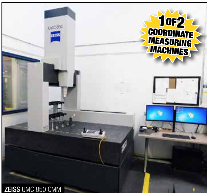
ZEISS UMC 850 CMM

180 Market Dr. • Milton, Ontario (Toronto)