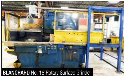
BLANCHARD No. 18 Rotary Surface Grinder