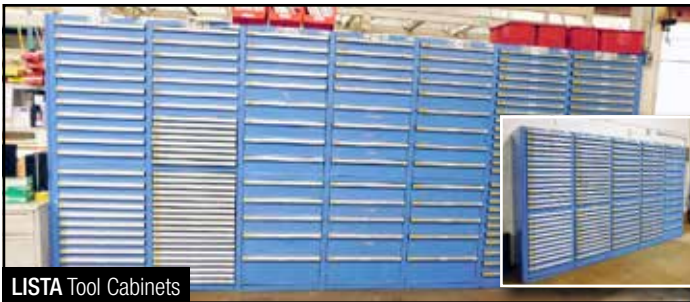
LISTA Tool Cabinets