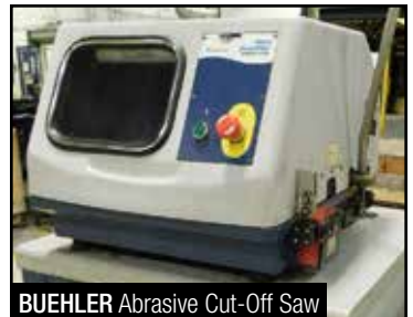
BUEHLER Abrasive Cut-Off Saw