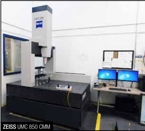
ZEISS UMC 850 CMM