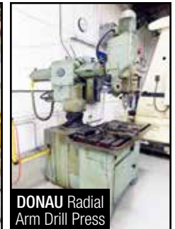
DONAU Radial Arm Drill Press