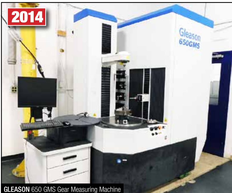
GLEASON 650 GMS Gear Measuring Machine