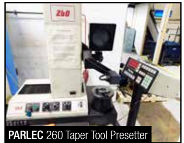
PARLEC 260 Taper Tool Presetter