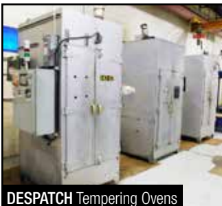
DESPATCH Tempering Ovens