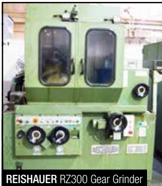
REISHAUER RZ300 Gear Grinder