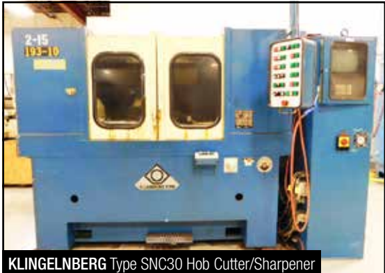
KLINGELBERG Type SNC30 Hob Cutter/Sharpener