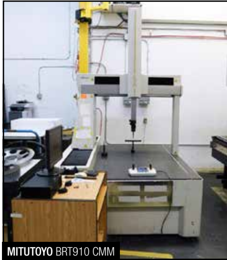
MITUTOYO BRT910 CMM