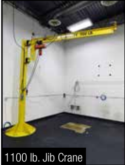
1100 lb. Jib Crane