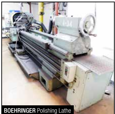
BOEHRINGER Polishing Lathe