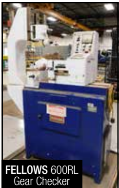
FELLOWS 600RL Gear Checker