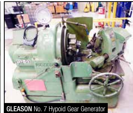
GLEASON No. 7 Hypoid Gear Generator