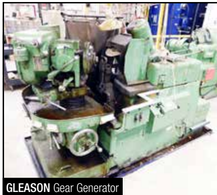
GLEASON Gear Generator