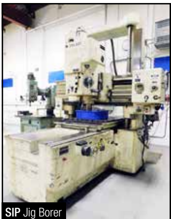
SIP Jig Borer