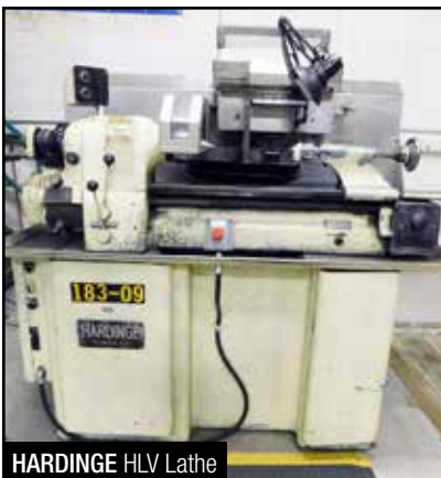
HARDINGE HLV Lathe