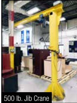
500 lb. Jib Crane