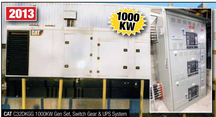
CAT C32DKGG 1000KW Gen Set, Switch Gear & UPS System

For Complete Information Please Contact: Mike McIntosh | 416-242-3560 | MMcintosh@maynards.com