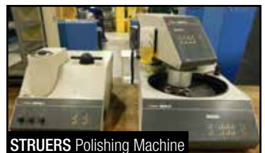
STRUERS Polishing Machine