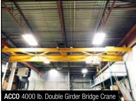
ACCO 4000 lb. Double Girder Bridge Crane