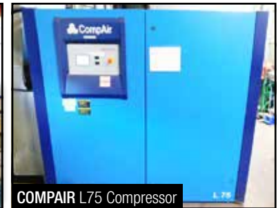
COMPAIR L75 Compressor