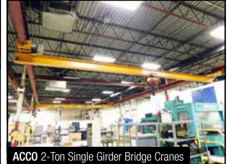
ACCO 2-Ton Single Girder Bridge Cranes