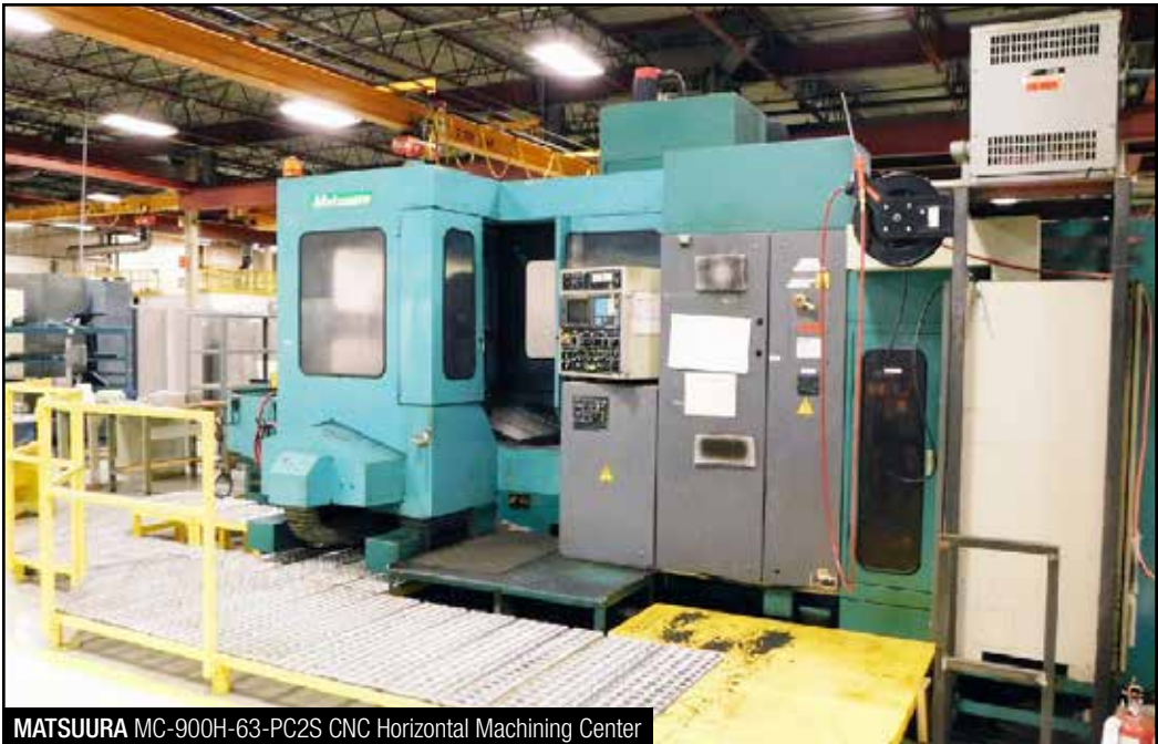
MATSUURA MC-900H-63-PC2S CNC Horizontal Machining Center

TERMS & CONDITIONS | PAYMENT: 25% NON-REFUNDABLE DEPOSIT ON AWARD OF BID. BALANCE WITHIN 24 HOURS. PAYMENT IS CASH, CASHIER'S CHEQUE, CERTIFIED CHEQUE, WIRE TRANSFER, COMPANY CHEQUE ONLY IF ACCOMPANIED BY A LETTER FROM YOUR BANK GUARANTEEING AMOUNT OF CHEQUE FOR DEPOSIT AND/OR PAYMENT IN FULL. NO PERSONAL CHEQUES. FULL PAYMENT MUST BE MADE BEFORE REMOVAL OF PURCHASE. REMOVAL: LAST DAY OF REMOVAL IS FRIDAY, JANUARY 26, 2018, AND AS FURTHER DEFINED IN THE SALE CATALOGUE. EVERYTHING IS SOLD "AS IS, WHERE IS". ALL SALES FINAL. COST AND RESPONSIBILITY FOR REMOVAL OF PURCHASE REMAINS WITH THE PURCHASER. EVERY EFFORT WILL BE MADE TO FACILITATE REMOVAL. WHILE QUANTITIES AND DESCRIPTIONS ARE BELIEVED TO BE ACCURATE, THE AUCTIONEER, OWNERS OR COUNSEL MAKE NO WARRANTIES OR GUARANTEES EITHER EXPRESSED OR IMPLIED AS TO AUTHENTICITY, GENUINENESS OF, OR DEFECTS IN ANY LOT AND WILL NOT BE HELD RESPONSIBLE FOR ANY ADVERTISING DISCREPANCIES OR INACCURACIES. NO WARRANTIES WHATSOEVER ARE MADE AS TO CONDITION, MERCHANTABILITY OR FITNESS FOR USE OF ANY ITEM. MAY WE SUGGEST YOU TAKE FULL ADVANTAGE OF THE PREVIEW AND INSPECTION PERIOD. SALE SUBJECT TO ADDITIONS, DELETIONS & PRIOR SALES. PLEASE CHECK AVAILABILITY OF EQUIPMENT.