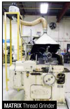
MATRIX Thread Grinder