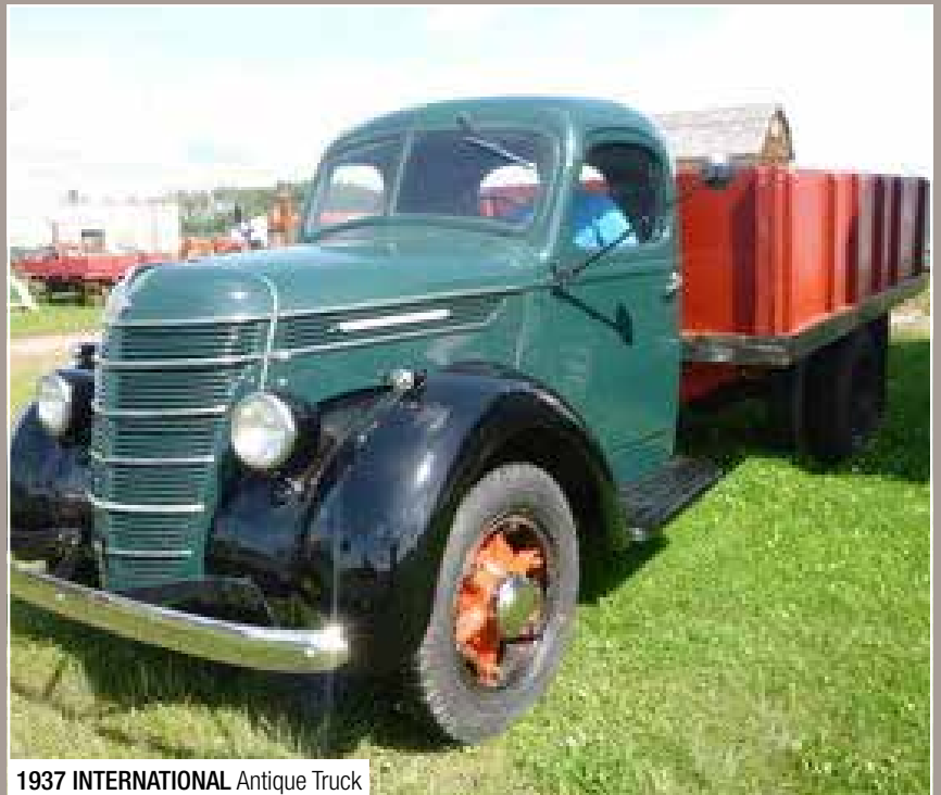
1937 INTERNATIONAL Antique Truck