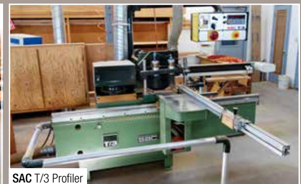
SAC T/3 Profiler