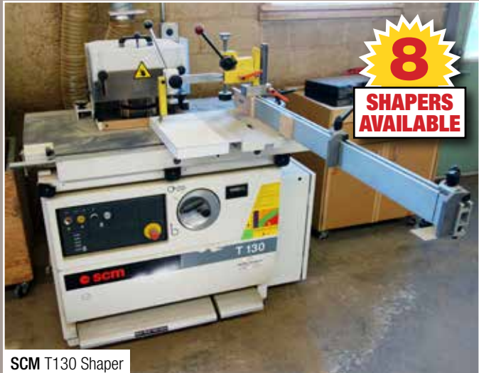
SCM T130 Shaper