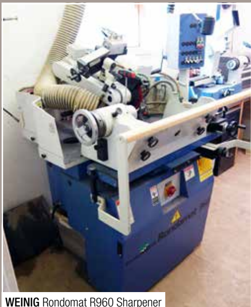
WEINIG Rondomat R960 Sharpener