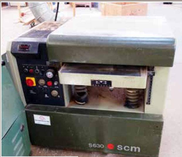
SCM S630 Thickness Planer