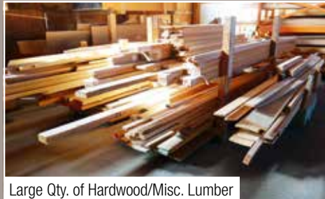
Large Qty. of Hardwood/Misc. Lumber