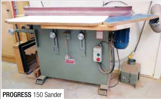
PROGRESS 150 Sander