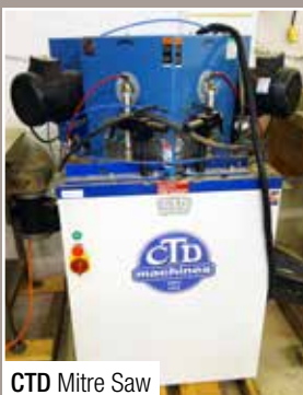
CTD Mitre Saw