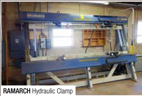
RAMARCH Hydraulic Clamp