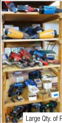
Large Qty. of Power Hand Tools