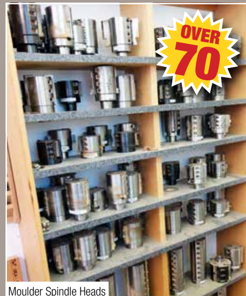
Moulder Spindle Heads