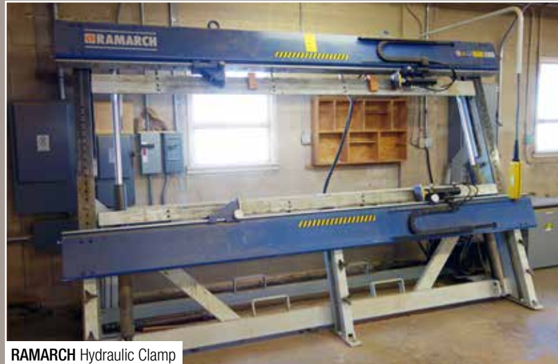
RAMARCH Hydraulic Clamp