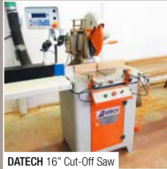
DATECH 16" Cut-Off Saw