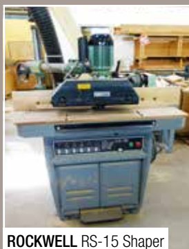
ROCKWELL RS-15 Shaper