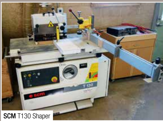
SCM T130 Shaper