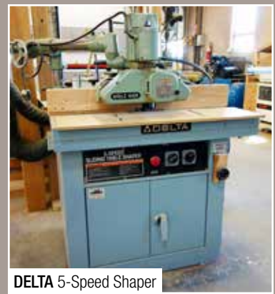
DELTA 5-Speed Shaper