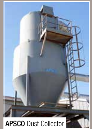
APSCO Dust Collector