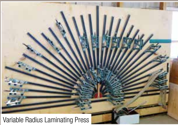
Variable Radius Laminating Press