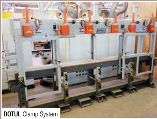
DOTUL Clamp System