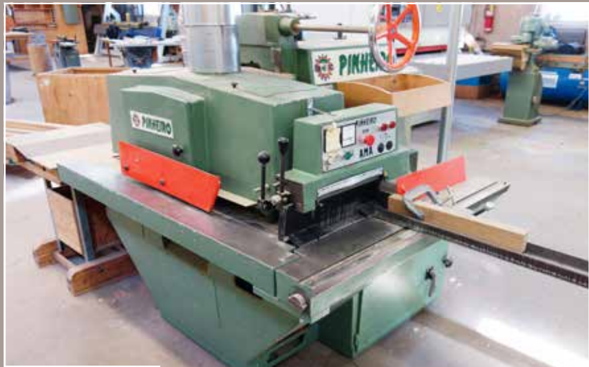
PINHEIRO Multi-Rip Saw