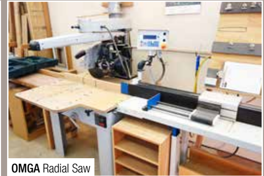
OMGA Radial Saw