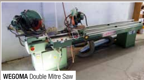
WEGOMA Double Mitre Saw

Visit www.maynards.com for complete lot-by-lot listings