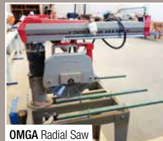
OMGA Radial Saw