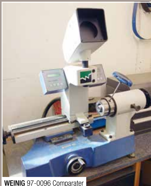
WEINIG 97-0096 Comparater