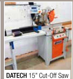
DATECH 15" Cut-Off Saw