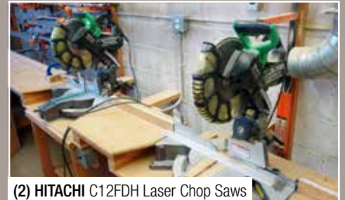
(2) HITACHI C12FDH Laser Chop Saws