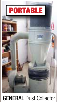
GENERAL Dust Collector