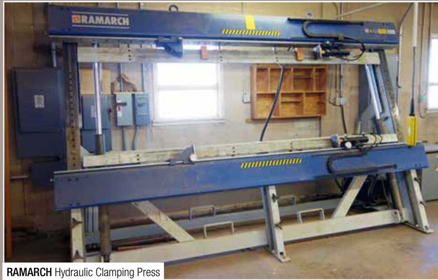
RAMARCH Hydraulic Clamping Press