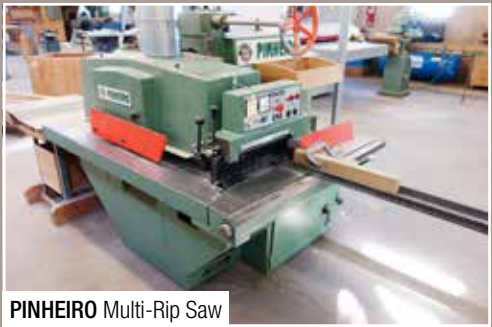
PINHEIRO Multi-Rip Saw