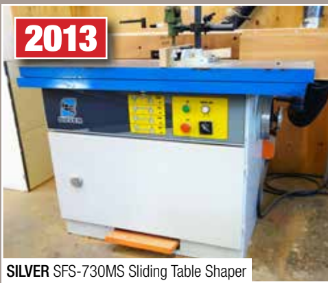
SILVER SFS-730MS Sliding Table Shaper