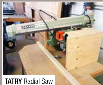
TATRY Radial Saw