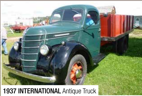
1937 INTERNATIONAL Antique Truck