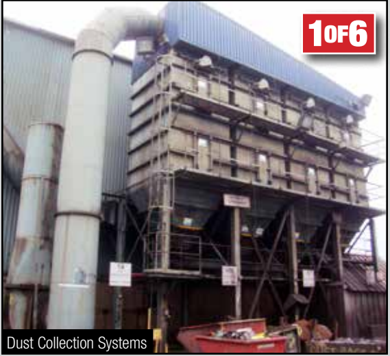
Dust Collection Systems

Wednesday, November 15 from 9am-5pm or by appointment