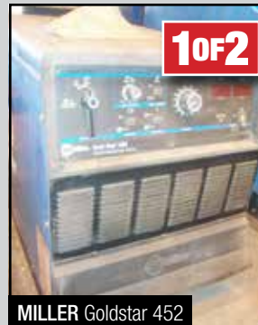
MILLER Goldstar 452