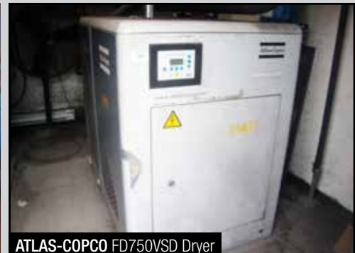
ATLAS-COPCO FD750VSD Dryer