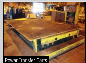
Power Transfer Carts