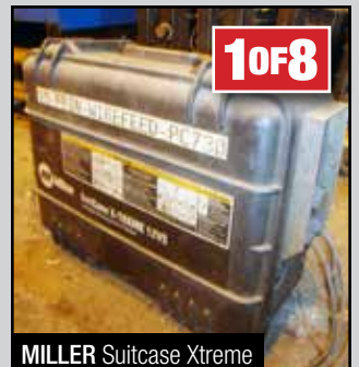
MILLER Suitcase Xtreme