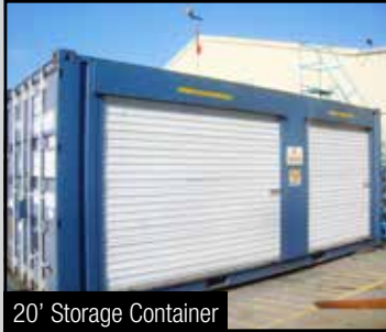
20' Storage Container