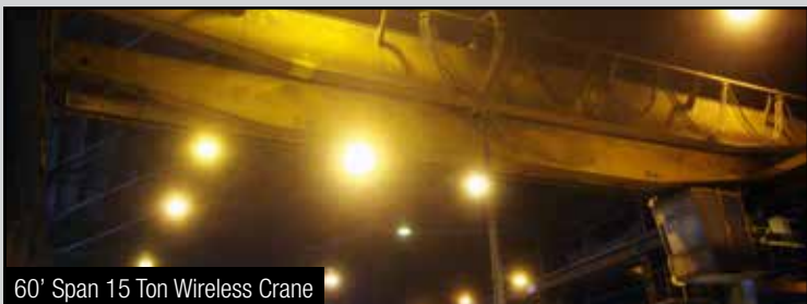
60' Span 15 Ton Wireless Crane