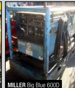
MILLER Big Blue 600D