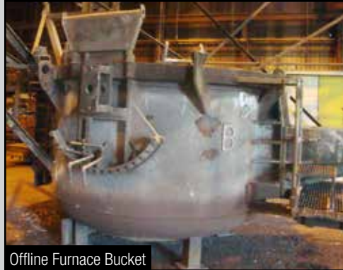
Offline Furnace Bucket