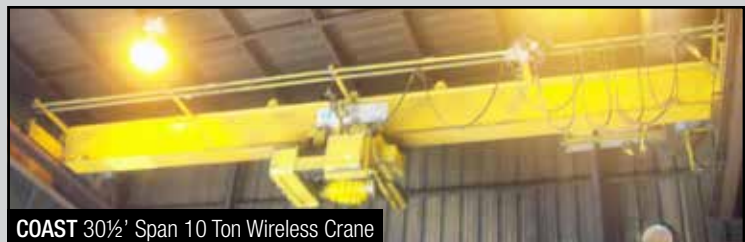
COAST 30½' Span 10 Ton Wireless Crane