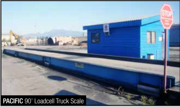
PACIFIC 90' Loadcell Truck Scale