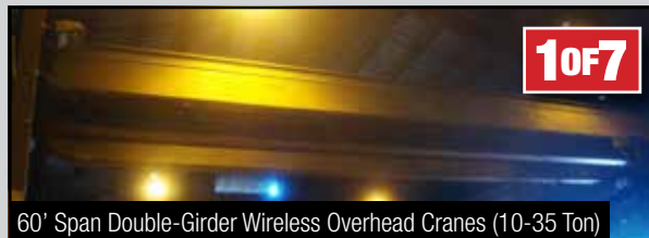
60' Span Double-Girder Wireless Overhead Cranes (10-35 Ton)