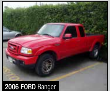
2006 FORD Ranger