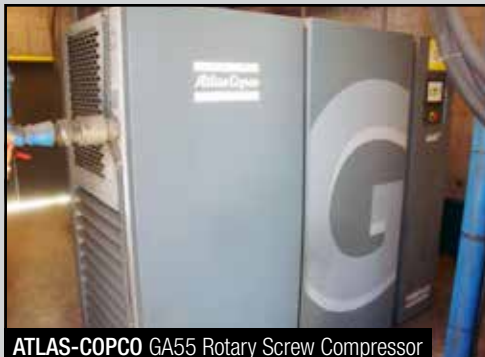
ATLAS-COPCO GA55 Rotary Screw Compressor