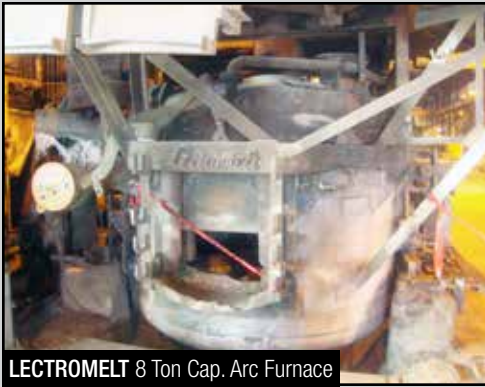
LECTROMELT 8 Ton Cap. Arc Furnace