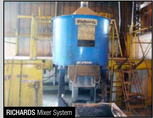
RICHARDS Mixer System