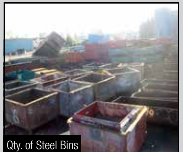
Qty. of Steel Bins