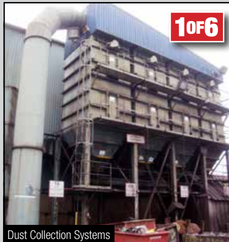
Dust Collection Systems