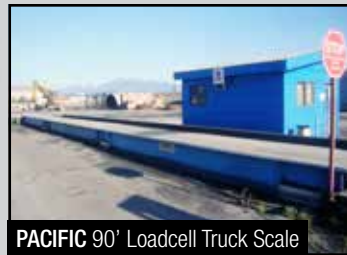
PACIFIC 90' Loadcell Truck Scale