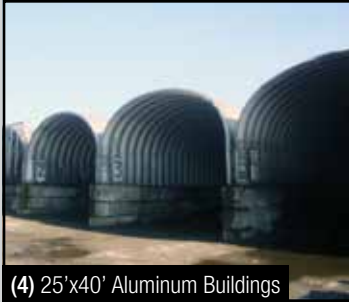
(4) 25'x40' Aluminum Buildings