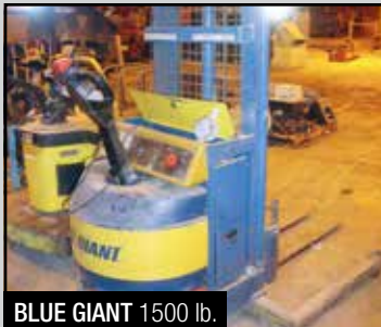
BLUE GIANT 1500 lb.