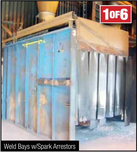
Weld Bays w/Spark Arrestors