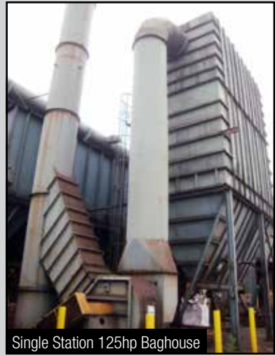
Single Station 125hp Baghouse