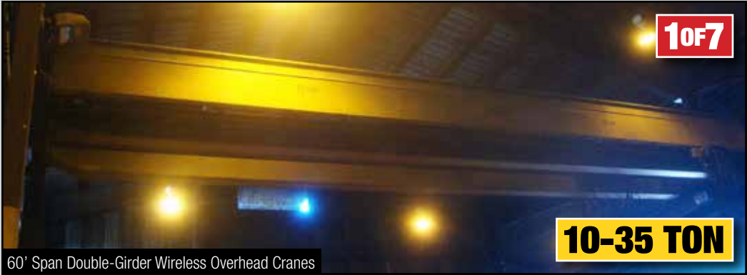
60' Span Double-Girder Wireless Overhead Cranes