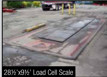
281 1/2' x 9 1/2' Load Cell Scale