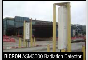
BICRON ASM3000 Radiation Detector