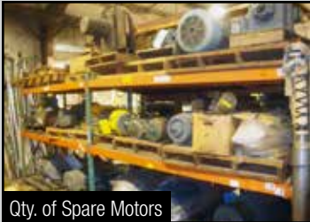
Qty. of Spare Motors