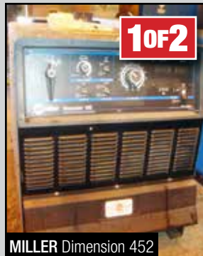
MILLER Dimension 452