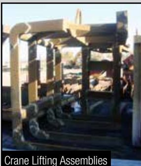
Crane Lifting Assemblies