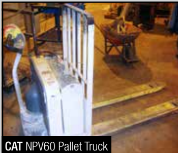
CAT NPV60 Pallet Truck