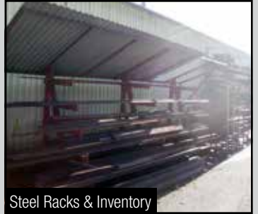
Steel Racks & Inventory