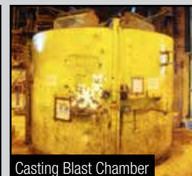
Casting Blast Chamber