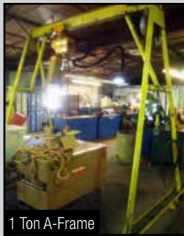
1 Ton A-Frame