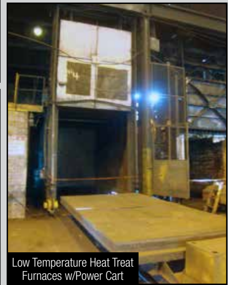
Low Temperature Heat Treat Furnaces w/Power Cart

For Complete Information Please Contact: Mike Seibold | 604-675-2227 | Mike.Seibold@maynards.com