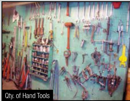
Qty. of Hand Tools