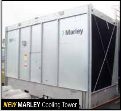
NEW MARLEY Cooling Tower