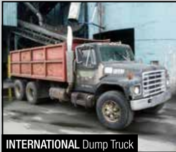
INTERNATIONAL Dump Truck