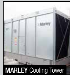
MARLEY Cooling Tower