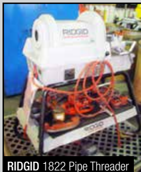
RIDGID 1822 Pipe Threader