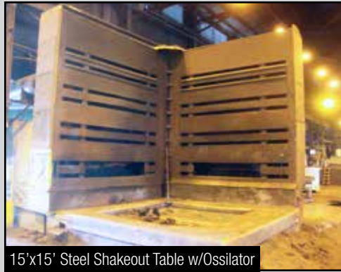
15'x15' Steel Shakeout Table w/Ossillator