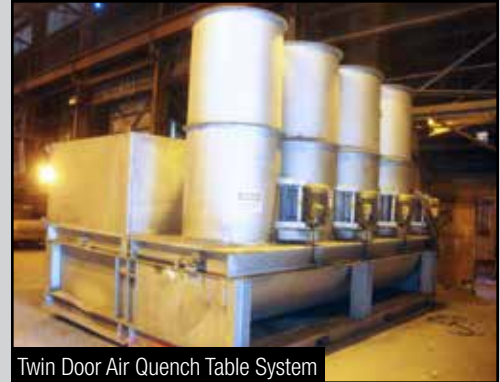
Twin Door Air Quench Table System