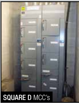
SQUARE D MCC's