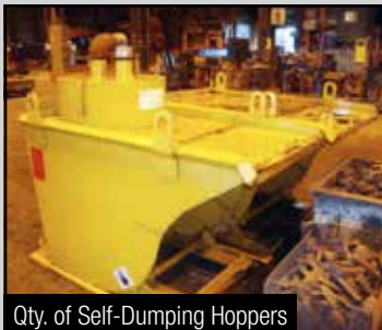
Qty. of Self-Dumping Hoppers