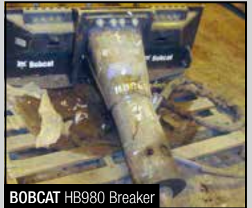
BOBCAT HB980 Breaker