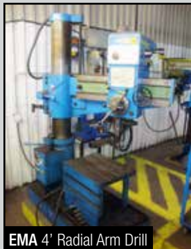
EMA 4' Radial Arm Drill