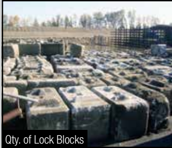
Qty. of Lock Blocks