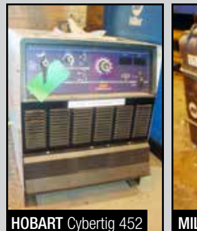
HOBART Cybertig 452