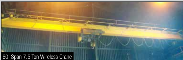
60' Span 7.5 Ton Wireless Crane