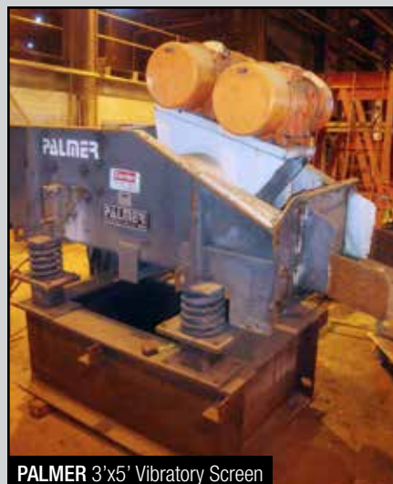
PALMER 3'x5' Vibratory Screen