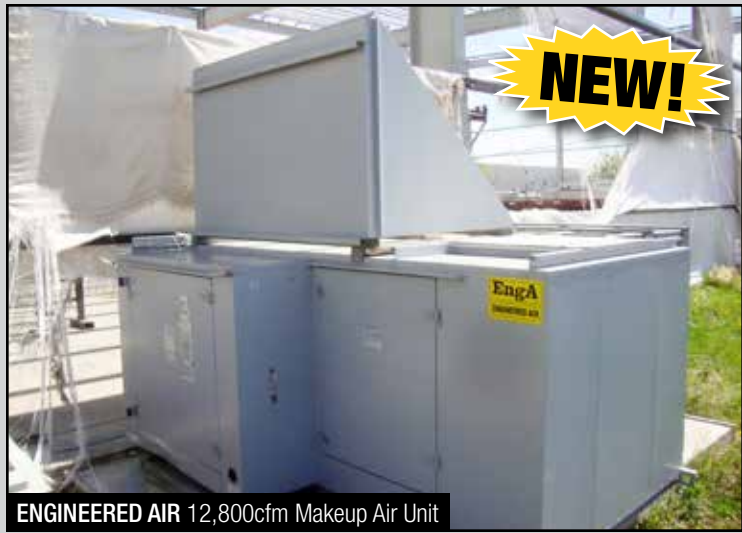
ENGINEERED AIR 12,800cfm Makeup Air Unit