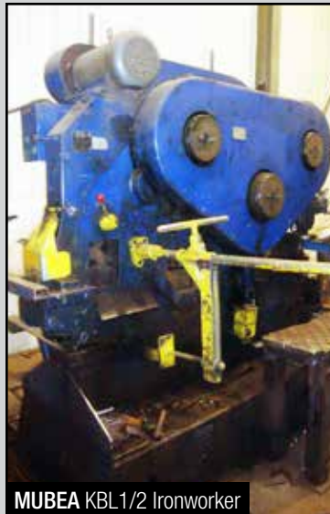
MUBEA KBL1/2 Ironworker