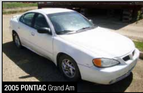
2005 PONTIAC Grand Am