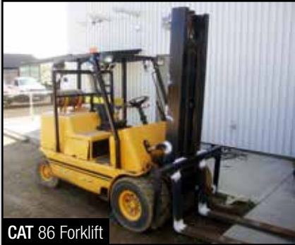
CAT 86 Forklift