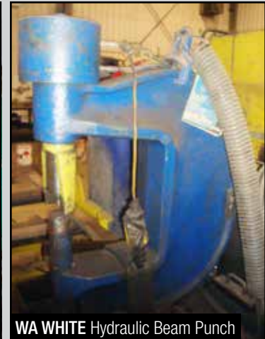
WA WHITE Hydraulic Beam Punch