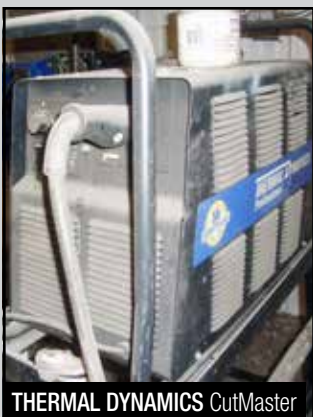
THERMAL DYNAMICS CutMaster