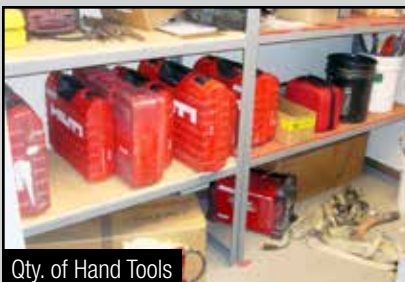
Qty. of Hand Tools