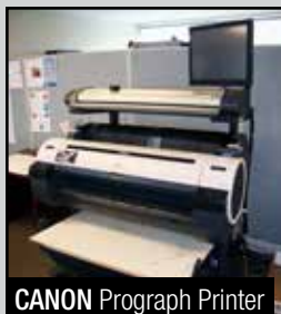
CANON Prograph Printer