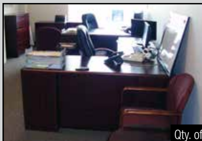
Qty. of Offices