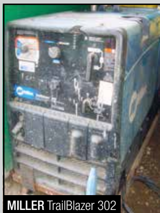
MILLER TrailBlazer 302