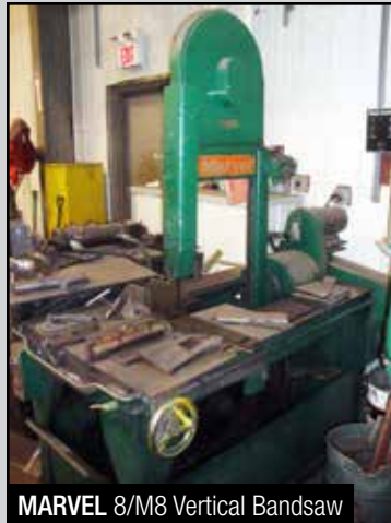
MARVEL 8/M8 Vertical Bandsaw