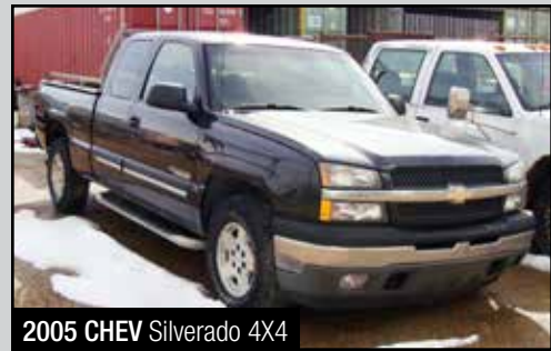
2005 CHEV Silverado 4X4