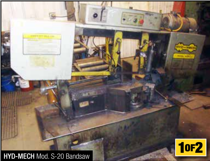
HYD-MECH Mod. S-20 Bandsaw