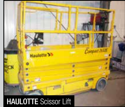
HAULOTTE Scissor Lift