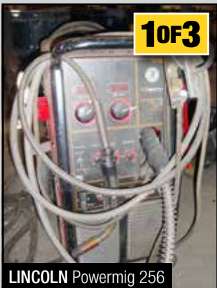
LINCOLN Powermig 256