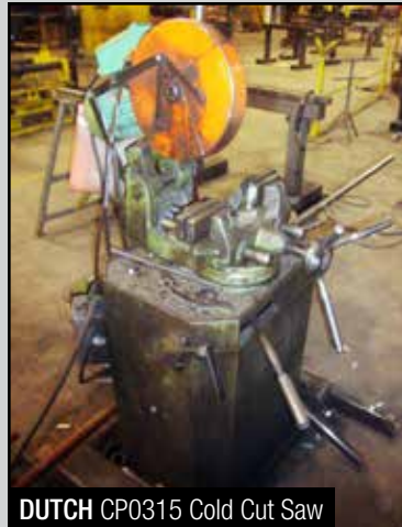
DUTCH CP0315 Cold Cut Saw