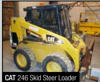
CAT 246 Skid Steer Loader