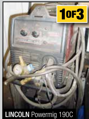
LINCOLN Powermig 190C