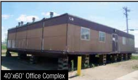
40'x60' Office Complex