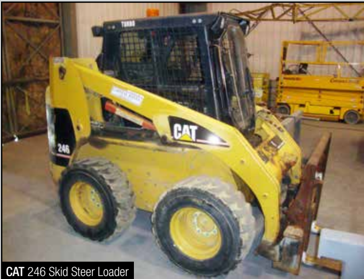
CAT 246 Skid Steer Loader