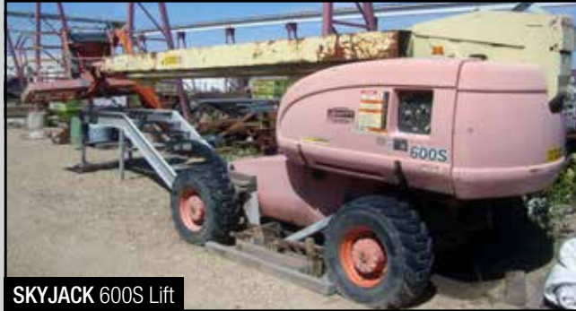
SKYJACK 600S Lift