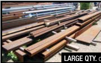
LARGE QTY. of Steel Inventory