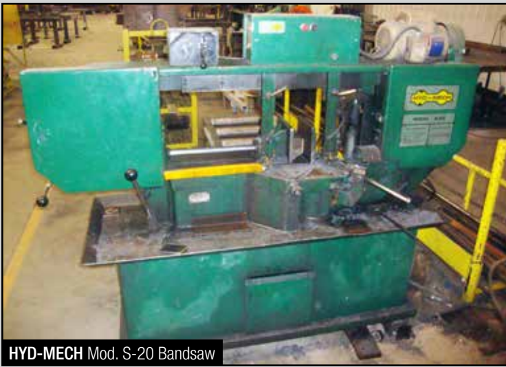
HYD-MECH Mod. S-20 Bandsaw