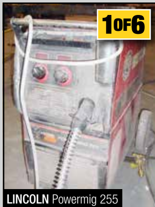
LINCOLN Powermig 255