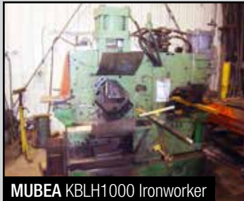
MUBEA KBLH1000 Ironworker