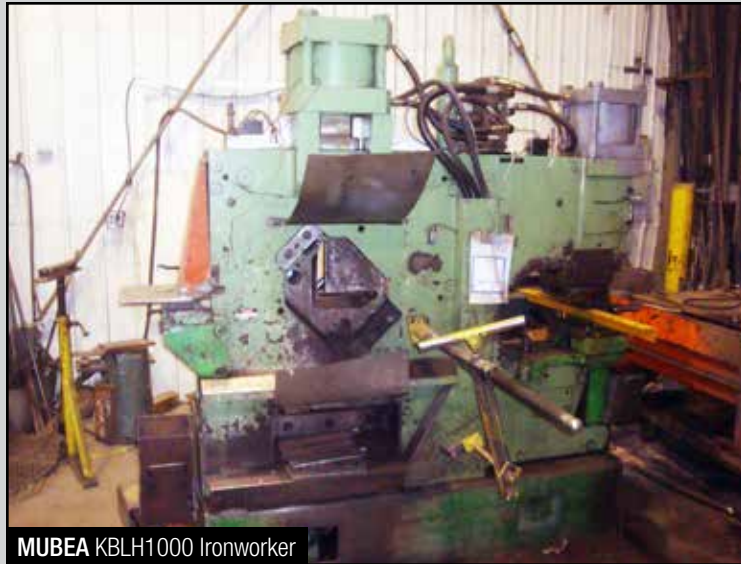
MUBEA KBLH1000 Ironworker