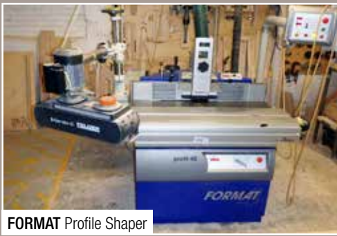
FORMAT Profile Shaper