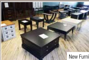
New Furniture Inventory