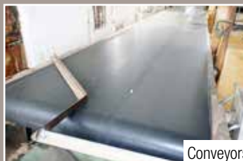
Conveyors & Transfers