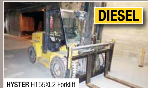
DIESEL HYSTER H155XL2 Forklift