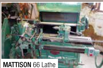
MATTISON 66 Lathe