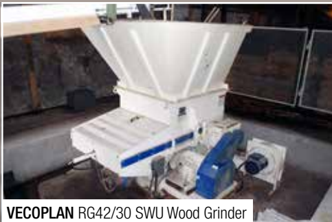
VECOPLAN RG42/30 SWU Wood Grinder