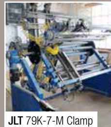
JLT 79K-7-M Clamp