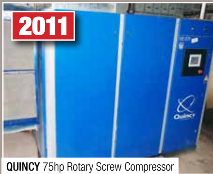
QUINCY 75hp Rotary Screw Compressor