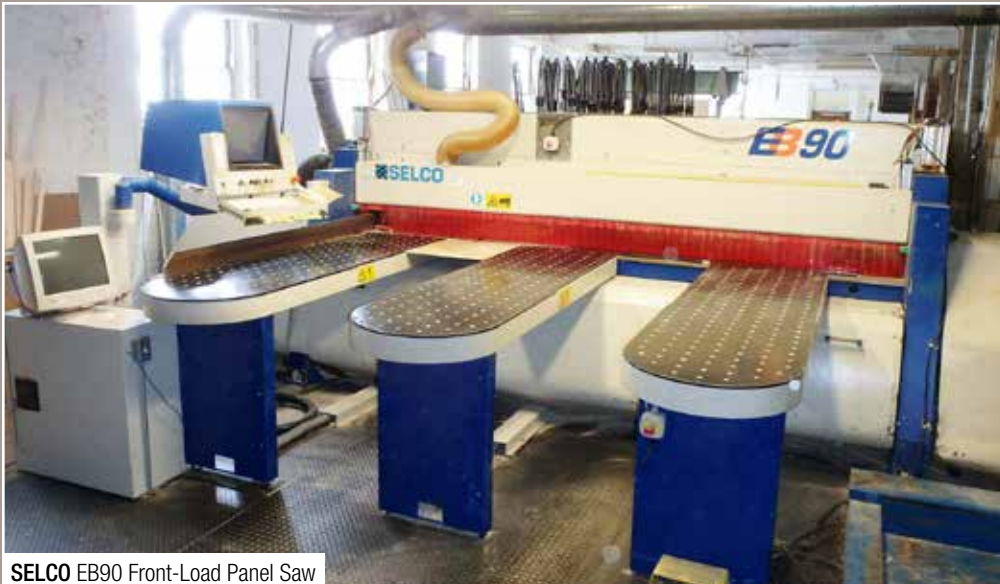
SELCO EB90 Front-Load Panel Saw