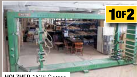
HOLZHER 1528 Clamps