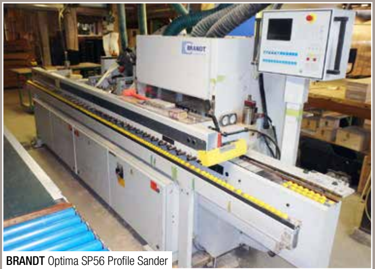
BRANDT Optima SP56 Profile Sander