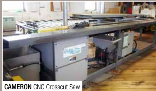
CAMERON CNC Crosscut Saw