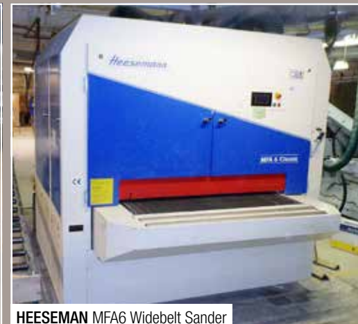
HEESEMAN MFA6 Widebelt Sander