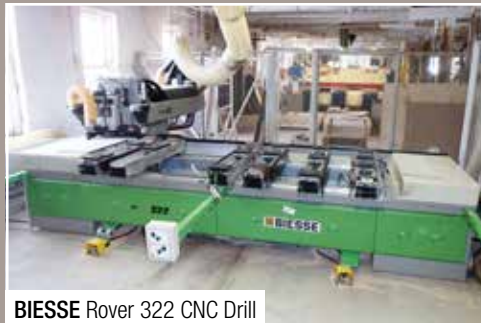
BIESSE Rover 322 CNC Drill