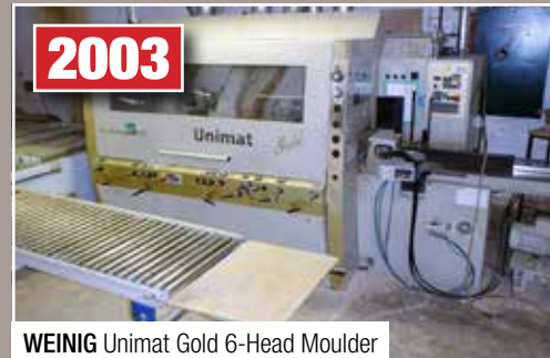
2003 WEINIG Unimat Gold 6-Head Moulder

For Complete Information Please Contact: Mike McIntosh | 647-828-8895 | MMcIntosh@maynards.com