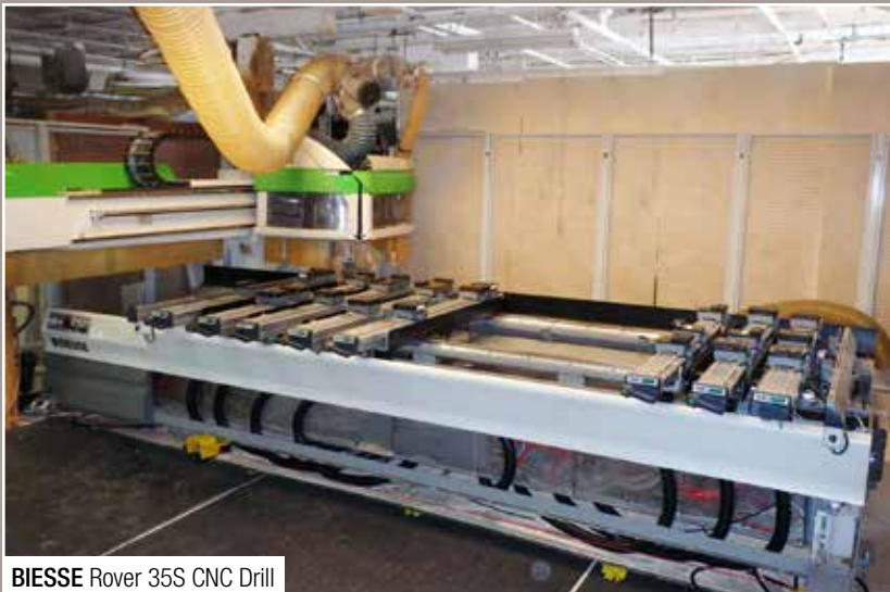
BIESSE Rover 35S CNC Drill

Mid Canada Millwork | Wed., April 5 th | Steinbach MB Late Model Woodworking Equipment / 85,000 Sq' Plant www.maynards.com