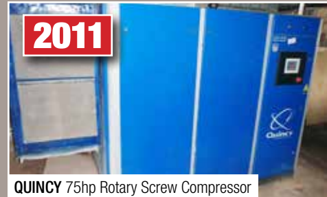
2011 QUINCY 75hp Rotary Screw Compressor