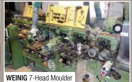
WEINIG 7-Head Moulder