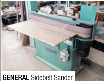
GENERAL Sidebelt Sander