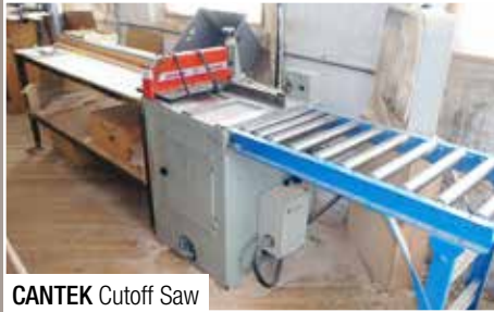
CANTEK Cutoff Saw