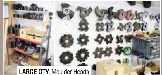
LARGE QTY. Moulder Heads