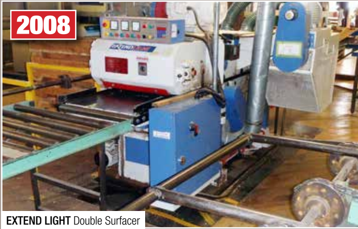
EXTEND LIGHT Double Surfacer