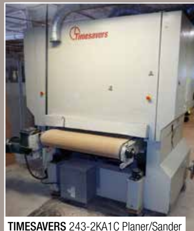
TIMESAVERS 243-2KA1C Planer/Sander