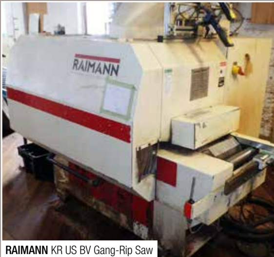
RAIMANN KR US BV Gang-Rip Saw