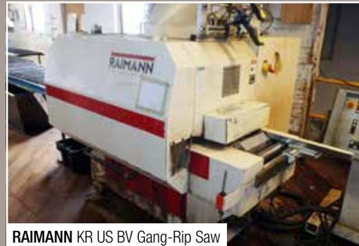
RAIMANN KR US BV Gang-Rip Saw