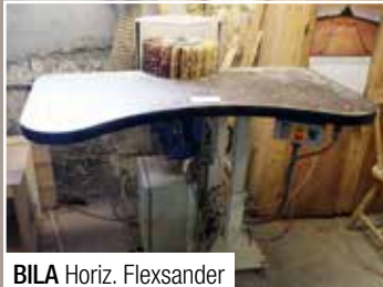
BILA Horiz. Flexsander