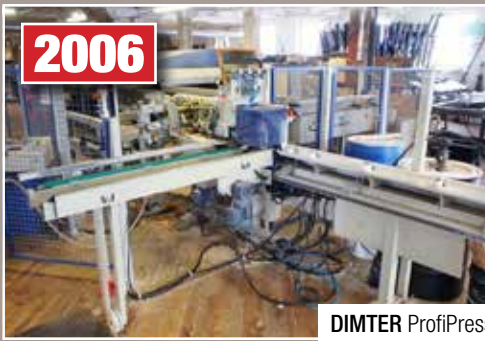
DIMTER ProfiPress L HF RF Glue Press