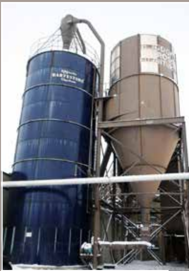
MACDONALD Dust Collection System