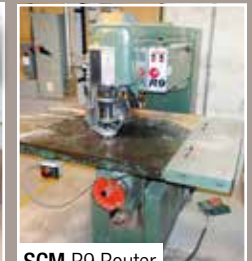
SCM R9 Router