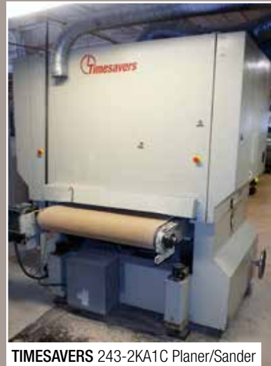
TIMESAVERS 243-2KA1C Planer/Sander