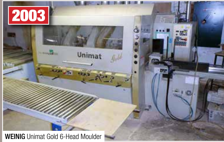
WEINIG Unimat Gold 6-Head Moulder