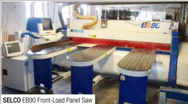
SELCO EB90 Front-Load Panel Saw