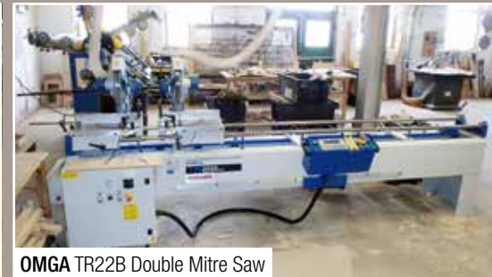
OMGA TR22B Double Mitre Saw