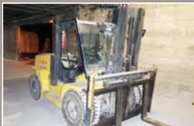
HYSTER H155XL2 Diesel Forklift