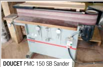
DOUCET PMC 150 SB Sander