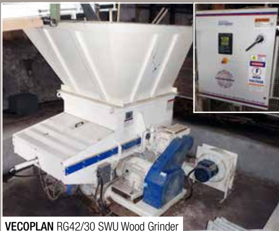
VECOPLAN RG42/30 SWU Wood Grinder