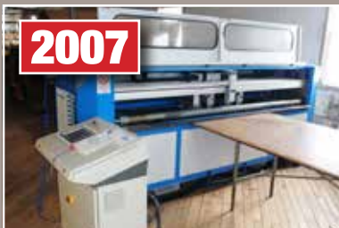
PANOTEC Packaging Machine

MISC. EQUIPMENT: Rolling Tool Carts • Hand Tools • Assorted Wire • Steel Stock Material • 4'x6" Horizontal Belt Sander • GENERAL 4'x6" Horizontal Belt Sander • PROGRESS Brush Sander • SUPERMAX Brush49 Brush Sander • OMEC ICM300 Manual Gluing Machine • EXTENDLIGHT Automatic Double Surface Thickness Planer • Shaper Tooling • OMGA TR28nc Double Mitre Chop Saw • Wooden Production Pallets • Racking w/Assorted Inventory • 2'x3' Hydraulic Scissor Lift • Bar Clamps • MASTERCRAFT Bench Top Drill Press • Inventory • Production Carts • Turn Tables, Lifts • Work Station • Tracked Carts • Assorted Drum Sander Belts • Cafeteria • Show Room Furniture