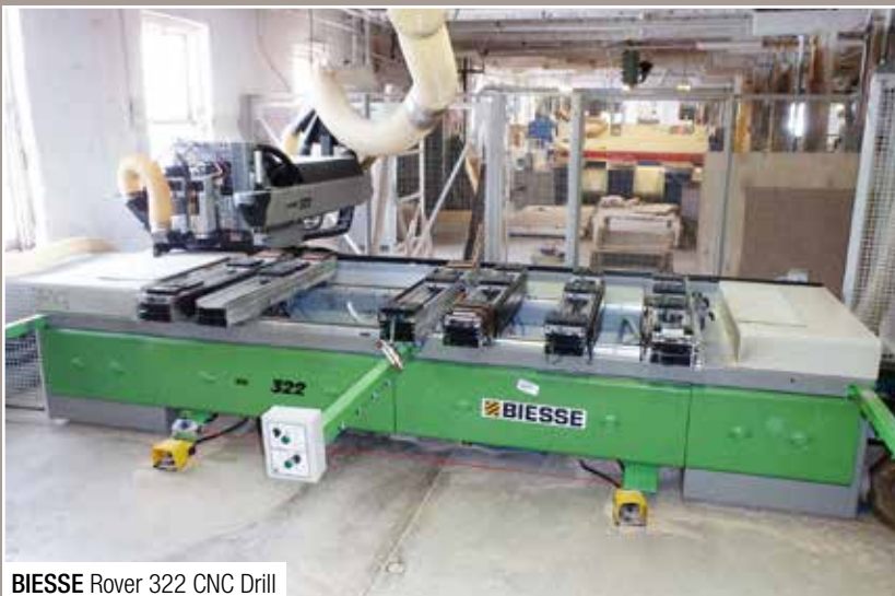
BIESSE Rover 322 CNC Drill