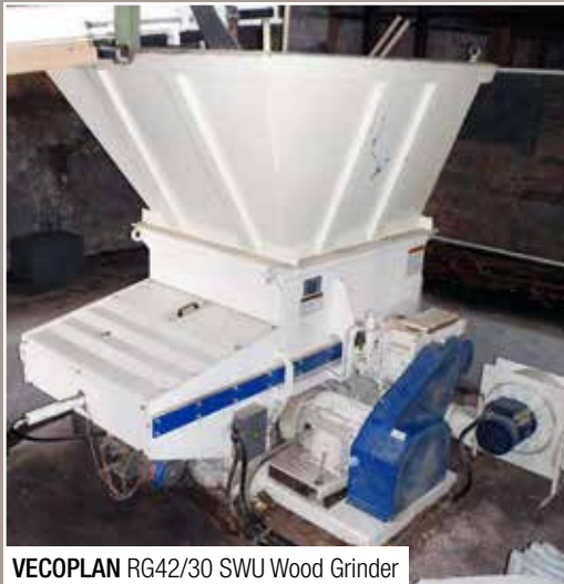
VECOPLAN RG42/30 SWU Wood Grinder