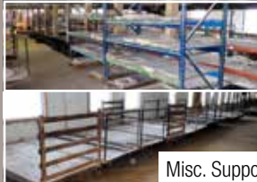
Misc. Support Equipment