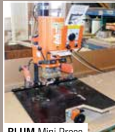
BLUM Mini Press