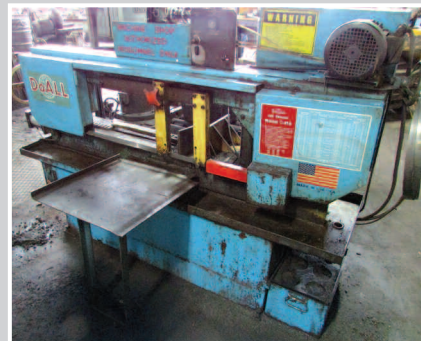
Doall C-916 Bandsaw