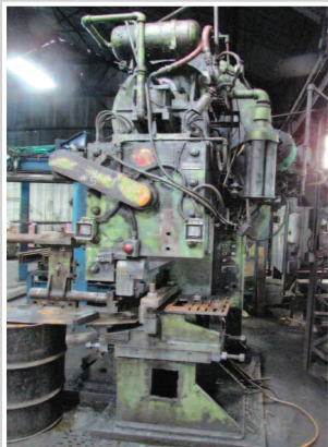
W&W 200-Ton Single End Bar Shear