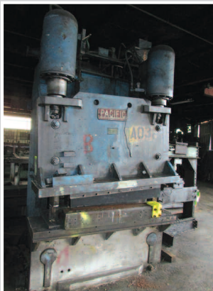
Pacific Hydraulic Press Brake