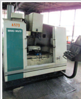
Hurco BMC 30D VMC