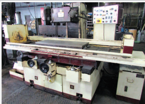
Chevalier FSG-1640AD Surface Grinder

LOCATION: 421 N Shamrock Street East Alton, IL