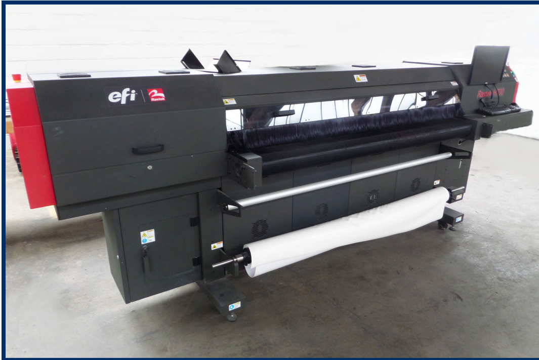
2009 EFI RASTEK H700 UV Printer

LATE MODEL FLAT BED / ROLL-TO-ROLL PRINTING EQUIPMENT