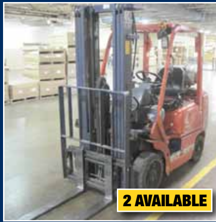
KALMAR 4,500 lb. cap. Forklift