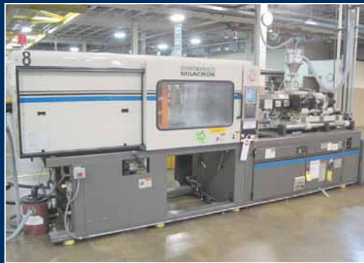
CINCINNATI MILACRON 220 Ton Injection Molder