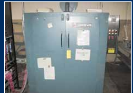
GRIEVE Model CBH-350 Oven