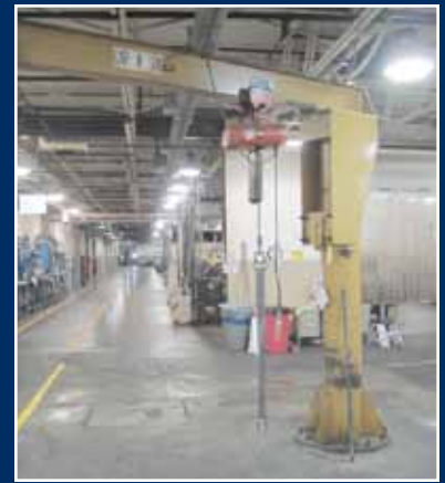
1 Ton Jib Crane