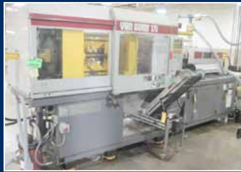
VAN DORN 170 Ton Injection Molder