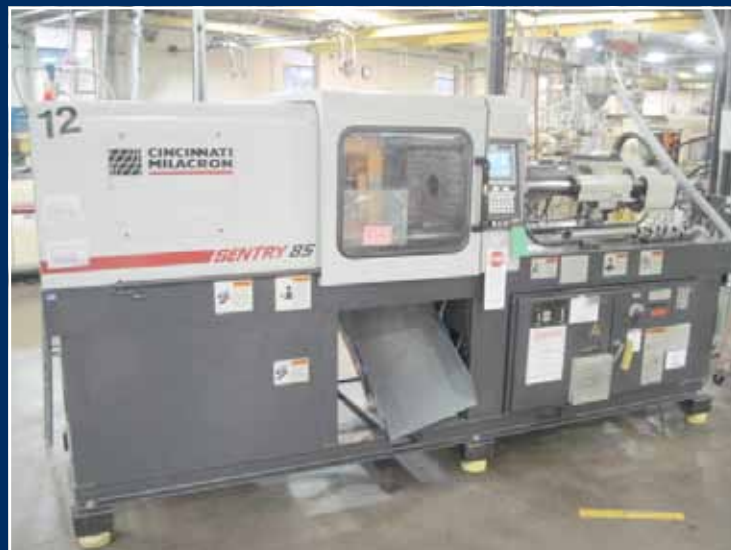
CINCINNATI MILACRON 85 Ton Injection Molder

Online bidding available | Register at www.bidspotter.com