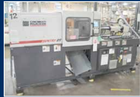
CINCINNATI MILACRON 85 Ton Injection Molder

AUCTION TERMS & CONDITIONS: PAYMENT: 25% NON-REFUNDABLE DEPOSIT ON AWARD OF BID. BALANCE WITHIN 48 HOURS. PAYMENT IS CASH, CASHIER'S CHECK, CERTIFIED CHECK, WIRE TRANSFER, COMPANY CHECK ONLY IF ACCOMPANIED BY A LETTER FROM YOUR BANK GUARANTEEING AMOUNT OF CHECK FOR DEPOSIT AND/OR PAYMENT IN FULL. NO PERSONAL CHECKS. FULL PAYMENT MUST BE MADE BEFORE REMOVAL OF PURCHASE. REMOVAL: LAST DAY OF REMOVAL IS FRIDAY, JANUARY 20, 2012. AND AS FURTHER DEFINED IN THE SALE CATALOGUE. EVERYTHING IS SOLD "AS IS, WHERE IS." ALL SALES FINAL. COST AND RESPONSIBILITY FOR REMOVAL OF PURCHASE REMAINS WITH THE PURCHASER. EVERY EFFORT WILL BE MADE TO FACILITATE REMOVAL. WHILE QUANTITIES AND DESCRIPTIONS ARE BELIEVED TO BE ACCURATE, THE AUCTIONEER, OWNERS OR COUNSEL MAKE NO WARRANTIES OR GUARANTEES EITHER EXPRESSED OR IMPLIED AS TO AUTHENTICITY, GENUINENESS OF, OR DEFECTS IN ANY LOT AND WILL NOT BE HELD RESPONSIBLE FOR ANY ADVERTISING DISCREPANCIES OR INACCURACIES. NO WARRANTIES WHATSOEVER ARE MADE AS TO CONDITION, MERCHANTABILITY OR FITNESS FOR USE OF ANY ITEM. MAY WE SUGGEST YOU TAKE FULL ADVANTAGE OF THE PREVIEW AND INSPECTION PERIOD. SALE SUBJECT TO ADDITIONS, DELETIONS & PRIOR SALES. PLEASE CHECK AVAILABILITY OF EQUIPMENT. BUYERS PREMIUMS: 15% ON-SITE, 15% ON-LINE