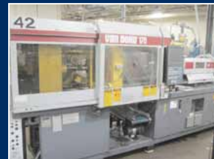
VAN DORN 170 Ton Injection Molder