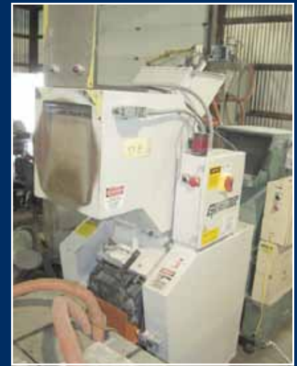
GRANUTEC Model IFG1212 Granulator