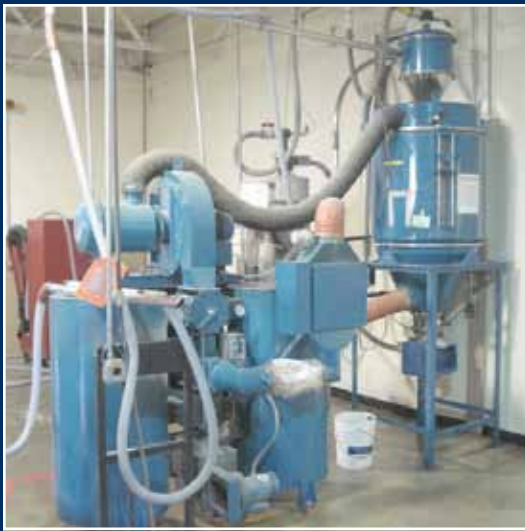
NOVATECH Vacuum Loader