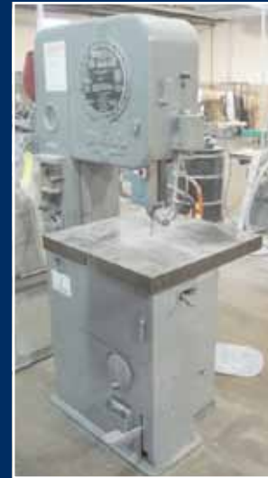
DO-ALL Vertical Band Saw