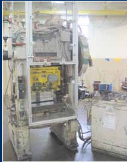
MINSTER 30 Ton Straight Side Press