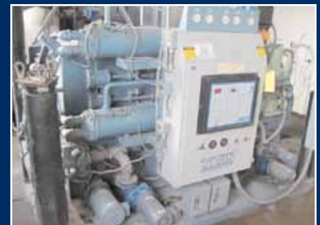
TITAN 30 Ton Chiller

For additional information visit: http://property.cassidyurley.com/3405WestSR28 www.ClintonCountyEconomicDevelopment.com