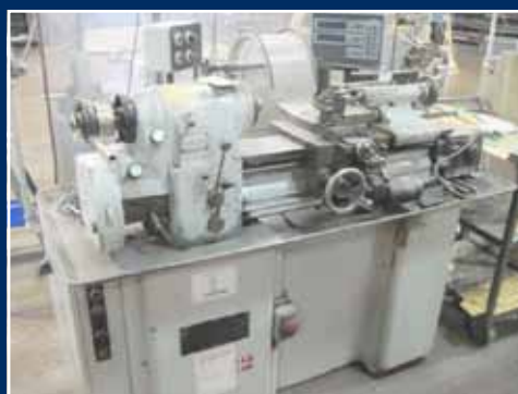
HARDINGE Model HLV-H Lathe