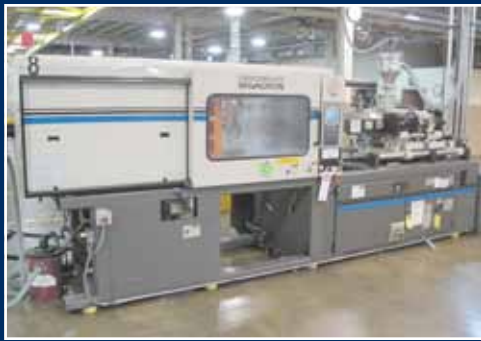
CINCINNATI MILACRON 220 Ton Injection Molder

FEATURING OVER 45 CINCINNATI MILACRON & VAN DORN INJECTION MOLDERS AS NEW AS 1998 AND UP TO 220 TONS