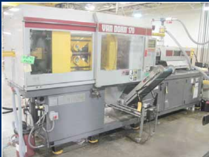
VAN DORN 170 Ton Injection Molder

FEATURING OVER 45 CINCINNATI MILACRON AND VAN DORN INJECTION MOLDERS AS NEW AS 1998 AND UP TO 220 TONS