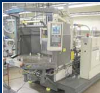
CINCINNATI Vertical Injection Molder