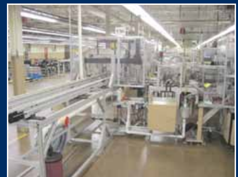
View of Assembly Equipment