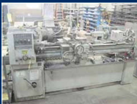
SHELDON Model 15 Lathe