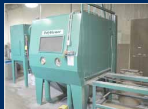
ABBRAISIVE SUPPLY CO. Blast Cabinet