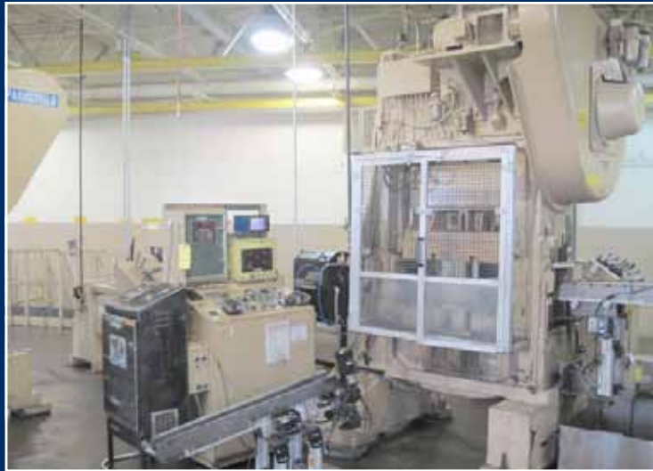
MINSTER 60 Ton Straight Side Press