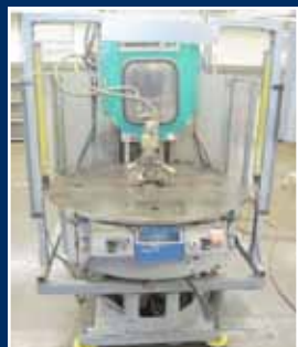
NEWBURY 80 Ton Vertical Injection Molder