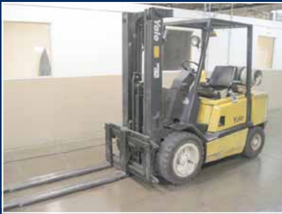
YALE 6,000 lb. cap. Forklift