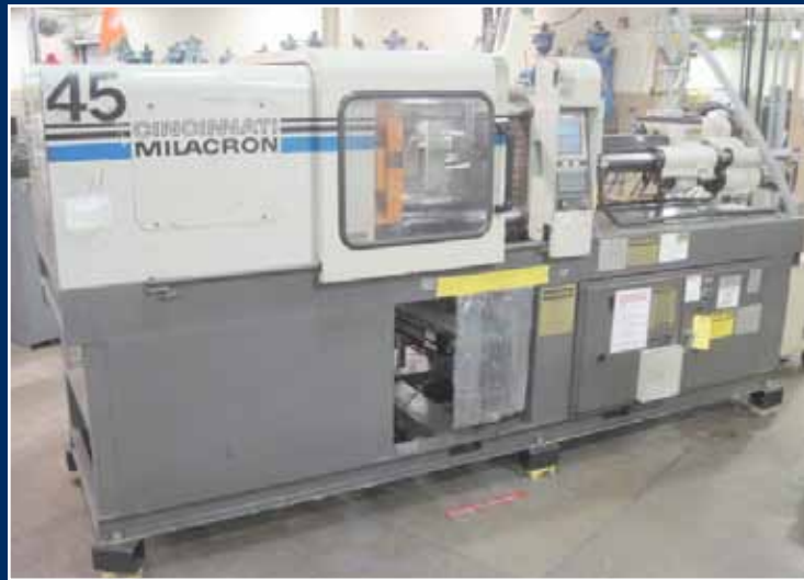
CINCINNATI MILACRON 165 Ton Injection Molder