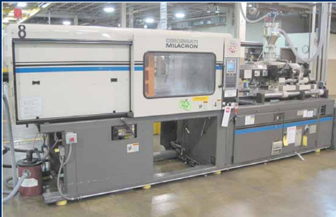
CINCINNATI MILACRON 220 Ton Injection Molder