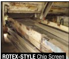
ROTEX-STYLE Chip Screen