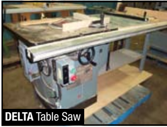
DELTA Table Saw