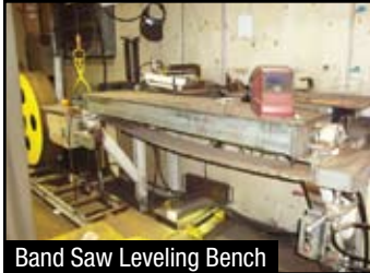
Band Saw Leveling Bench