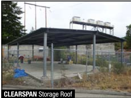
CLEARSPAN Storage Roof