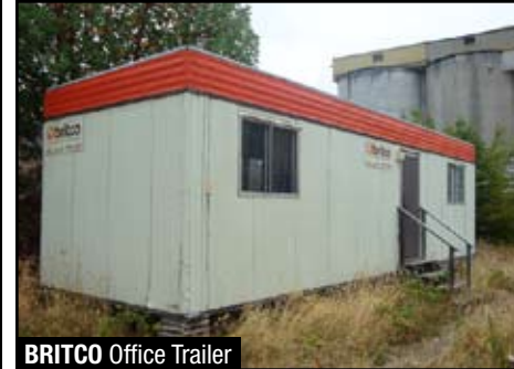
BRITCO Office Trailer