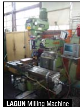
LAGUN Milling Machine