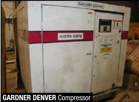
GARDNER DENVER Compressor