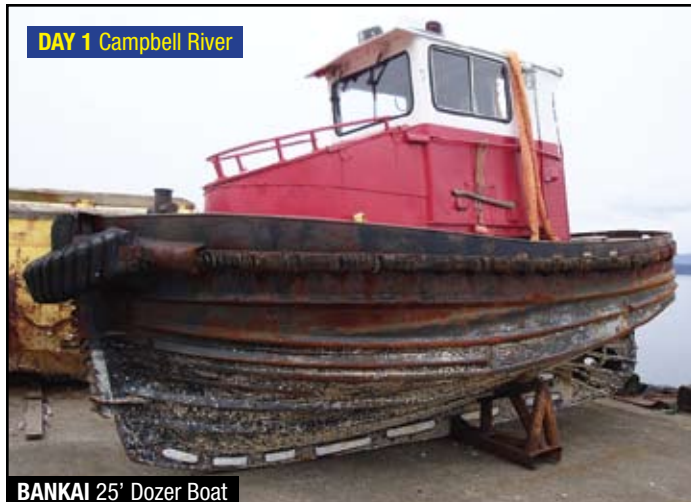
BANKAI 25' Dozer Boat