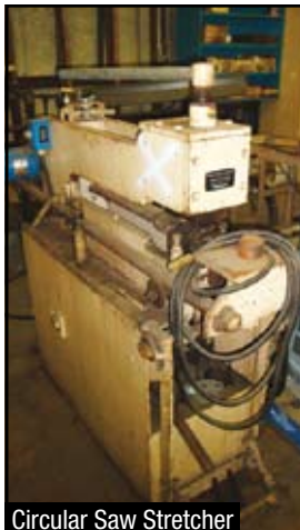
Circular Saw Stretcher