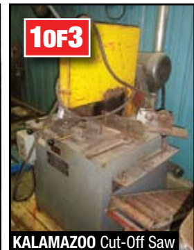
KALAMAZOO Cut-Off Saw