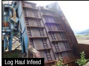
Log Haul Infeed