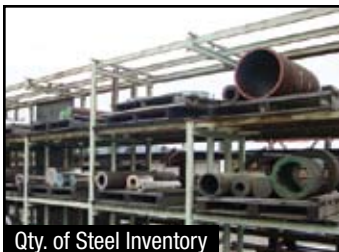
Qty. of Steel Inventory