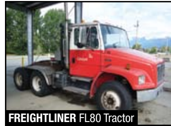
FREIGHTLINER FL80 Tractor