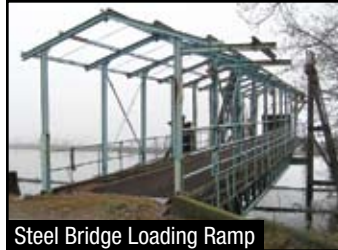
Steel Bridge Loading Ramp