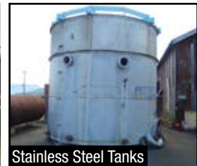
Stainless Steel Tanks