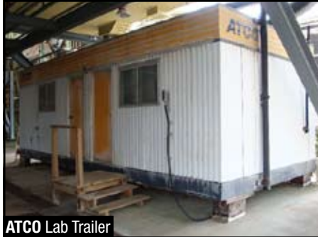
ATCO Lab Trailer