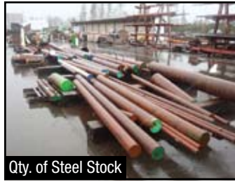
Qty. of Steel Stock