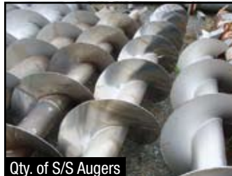
Qty. of S/S Augers