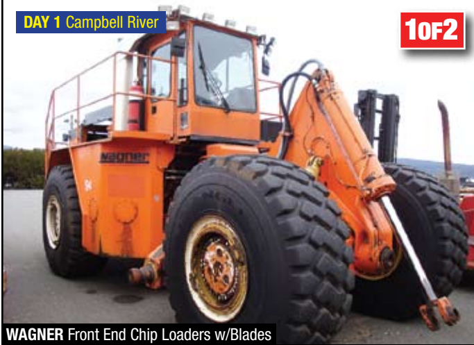
WAGNER Front End Chip Loaders w/Blades