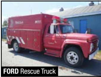
FORD Rescue Truck