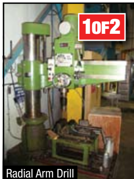
Radial Arm Drill