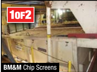
BM&M Chip Screens