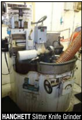
HANCHETT Slitter Knife Grinder