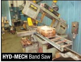
HYD-MECH Band Saw