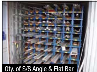
Qty. of S/S Angle &amp; Flat Bar