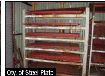
Qty. of Steel Plate