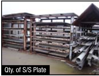
Qty. of S/S Plate