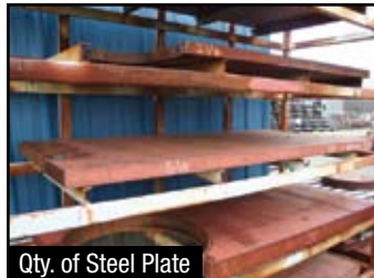
Qty. of Steel Plate