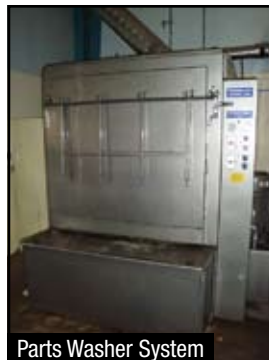
Parts Washer System