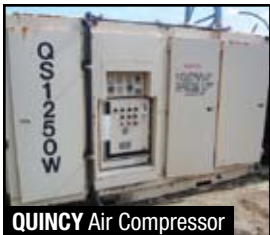
QUINCY Air Compressor