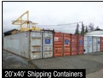
20'x40' Shipping Containers