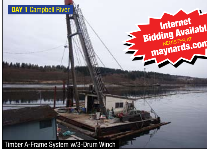
Timber A-Frame System w/3-Drum Winch

Internet Bidding Available REGISTER AT maynards.com