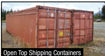
Open Top Shipping Containers