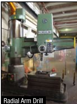
Radial Arm Drill