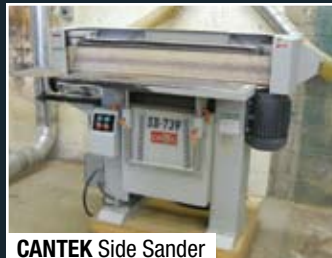
CANTEK Side Sander