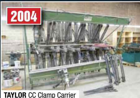
2004 TAYLOR CC Clamp Carrier