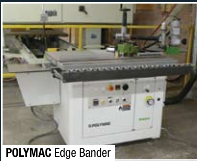
POLYMAC Edge Bander