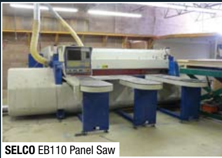
SELCO EB110 Panel Saw