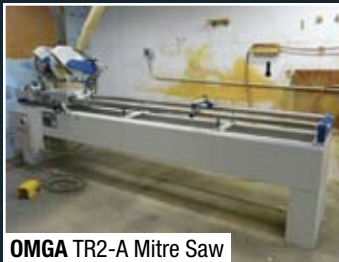
OMGA TR2-A Mitre Saw