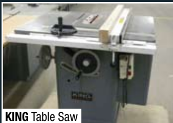
KING Table Saw