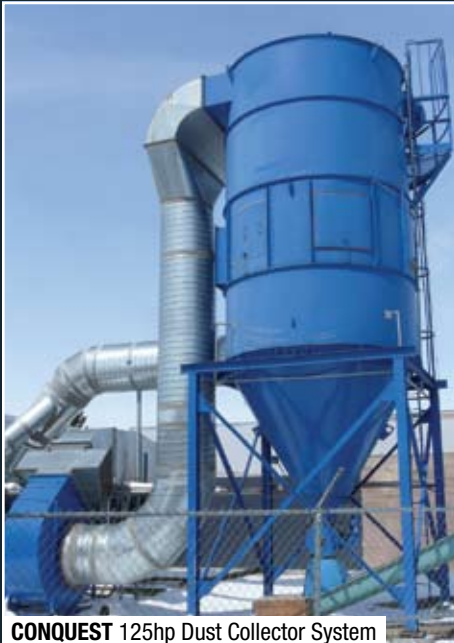
CONQUEST 125hp Dust Collector System