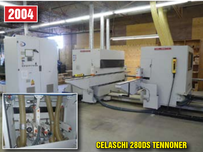
CELASCHI 280DS TENNONER