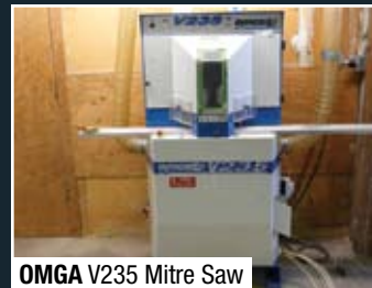
OMGA V235 Mitre Saw