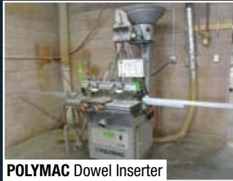
POLYMAC Dowel Inserter