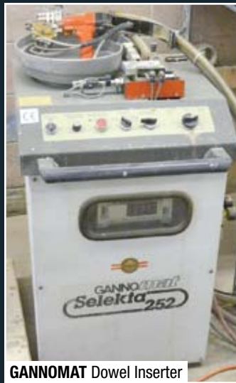
GANNOMAT Dowel Inserter