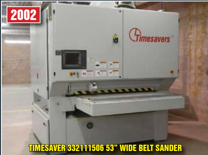
TIMESAVER 332111506 53" WIDE BELT SANDER