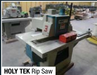
HOLY TEK Rip Saw