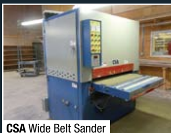
CSA Wide Belt Sander