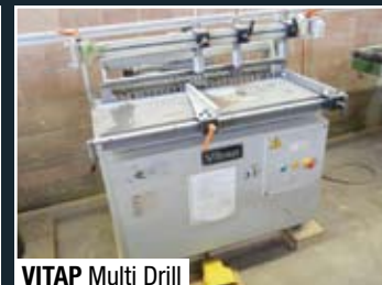
VITAP Multi Drill