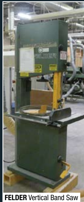
FELDER Vertical Band Saw