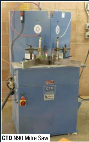
CTD N90 Mitre Saw