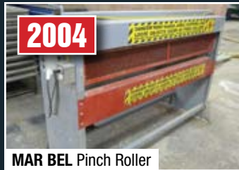
MAR BEL Pinch Roller