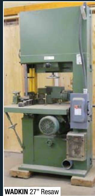
WADKIN 27" Resaw