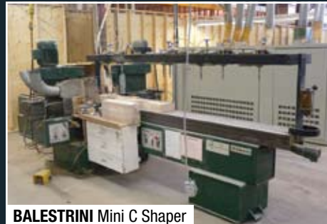
BALESTRINI Mini C Shaper