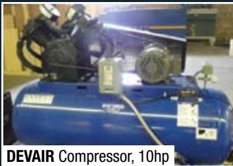
DEVAIR Compressor, 10hp