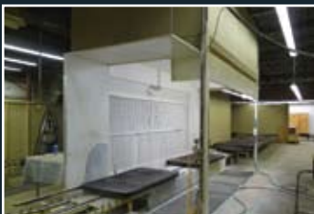
Views of Paint Line