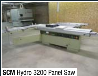
SCM Hydro 3200 Panel Saw