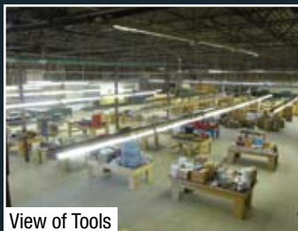
View of Tools