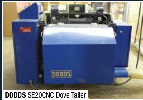
DODDS SE20CNC Dove Tailer