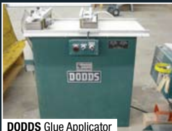
DODDS Glue Applicator