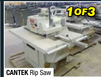
CANTEK Rip Saw