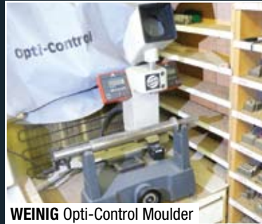
WEINIG Opti-Control Moulder