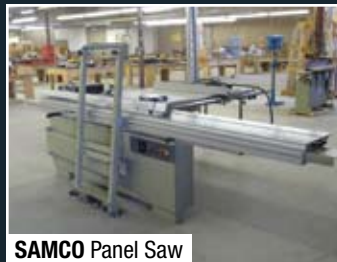
SAMCO Panel Saw