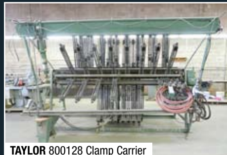
TAYLOR 800128 Clamp Carrier