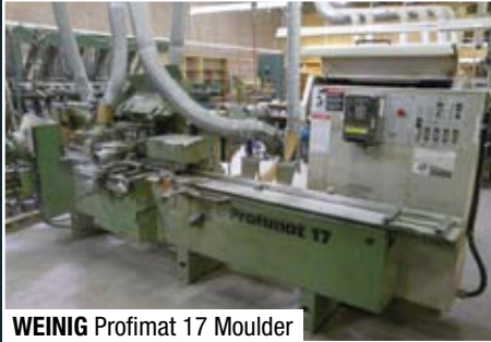
WEINIG Profimat 17 Moulder