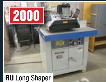
RU Long Shaper