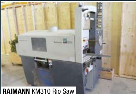
RAIMANN KM310 Rip Saw