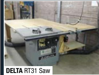
DELTA RT31 Saw