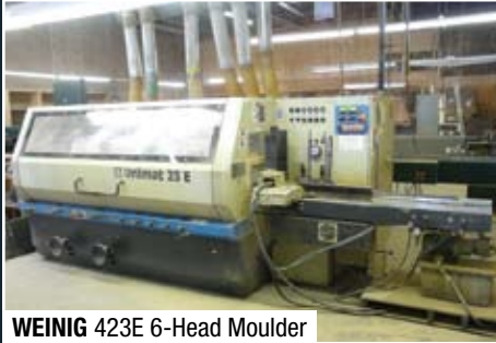
WEINIG 423E 6-Head Moulder