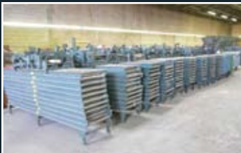
Views of Approx. 4500' Roller Conveyor