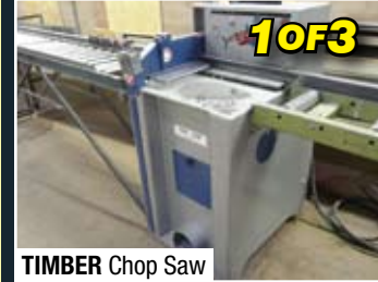
TIMBER Chop Saw