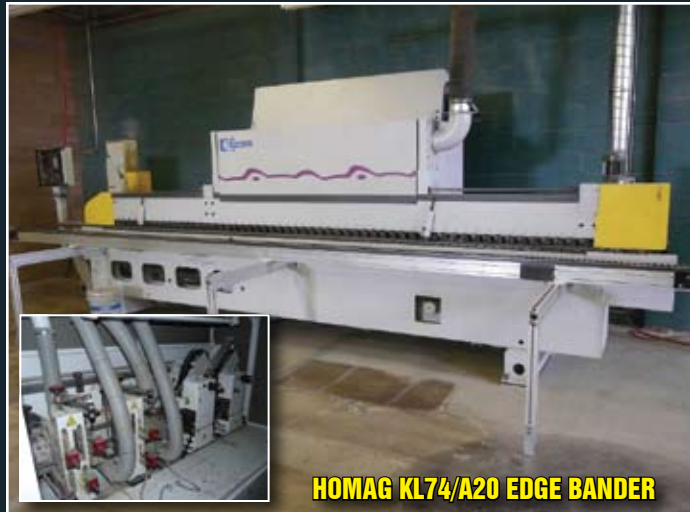
HOMAG KL74/A20 EDGE BANDER