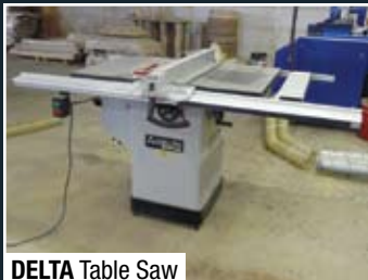
DELTA Table Saw