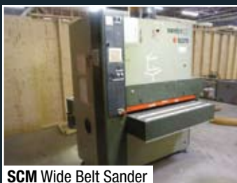
SCM Wide Belt Sander