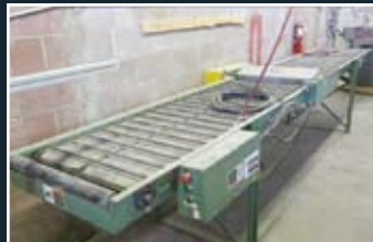
TAYLOR Glue Applicator