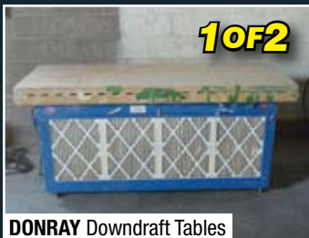
DONRAY Downdraft Tables