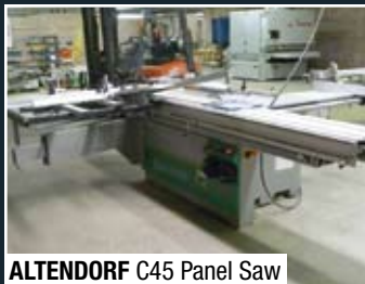
ALTENDORF C45 Panel Saw