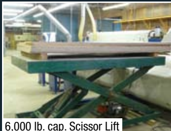
6,000 lb. cap. Scissor Lift