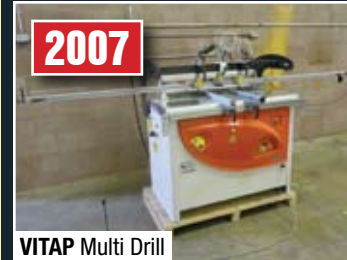
VITAP Multi Drill