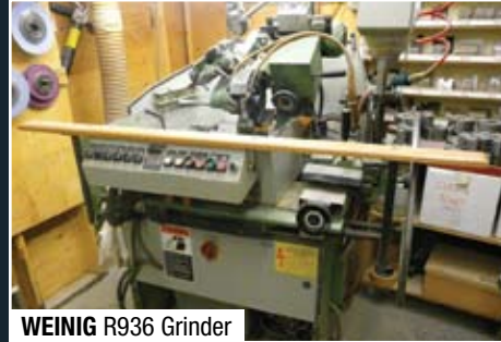
WEINIG R936 Grinder