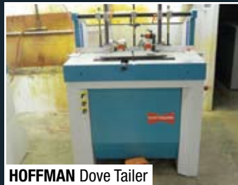
HOFFMAN Dove Tailer