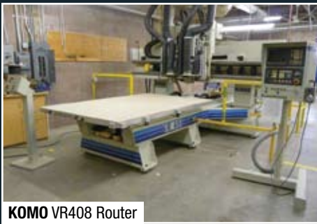
KOMO VR408 Router