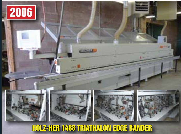
HOLZ-HER 1488 TRIATHALON EDGE BANDER