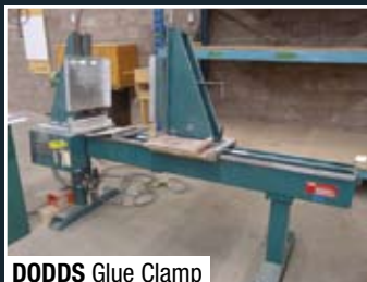
DODDS Glue Clamp