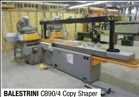
BALESTRINI CB90/4 Copy Shaper