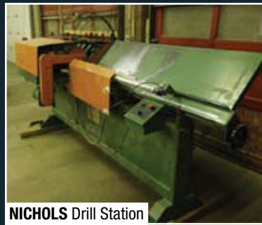
NICHOLS Drill Station