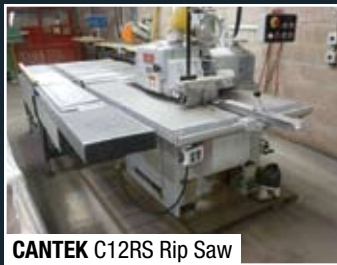
CANTEK C12RS Rip Saw